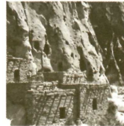
RESTORED TALUS HOUSE