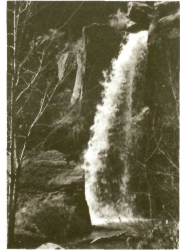
LOWER FALLS, FRIJOLES CREEK