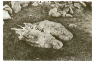
SHRINE OF THE STONE LIONS