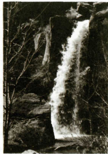
LOWER FALLS, FRIJOLES CREEK