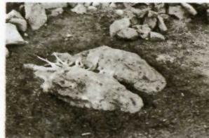
SHRINE OF THE STONE LIONS