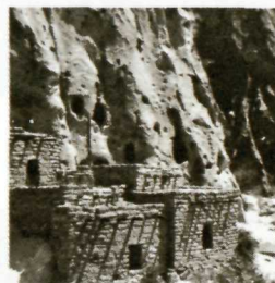
RESTORED TALUS HOUSE