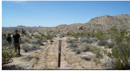
Example before vertical mulching