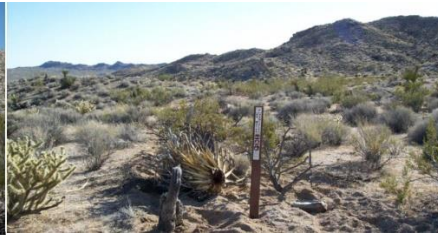
Example after vertical mulching

Beginning in the second quarter, Clark County's Desert Conservation Program, in coordination with BLM, will implement restoration actions in the approved Piute-Eldorado Area of Critical Environmental Concern Management Plan with funding provided through the Southern Nevada Public Lands Management Act. The goal will be to restore, improve or enhance disturbed desert tortoise critical habitat and to minimize the potential of re-disturbance of the sites or creation of new sites. Restoration will focus on linear disturbances caused by unauthorized off-road vehicle use and within the Piute-Eldorado Valley Area of Critical Environmental Concern (almost entirely within Avi Kwa Ame National Monument.) This will include vertical mulching, native species planting and construction of barriers and fences.