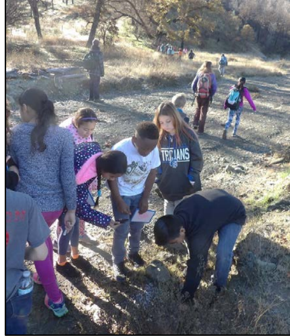
Student field trip to the Cache Creek Natural Area.

Two presentations were made at the Mary Stephens Library in Davis, CA. The first was provided by BLM and USFS staff at the request of the Yolo County Historical Society. This presentation described the monument management planning process and described the type of heritage resource information that historical society volunteers might be able to provide. The second was a presentation made by Tuleyome as part of their “Conservation and You” lecture series. This presentation highlighted some of the trail maintenance work that Tuleyome has done within the monument. Additional public outreach efforts include a boyscout camping trip in the Cache Creek Natural Area, USFS and BLM booths at the Lake County Fair, and fellowship recruitment efforts at the 2017 California Youth Summit.