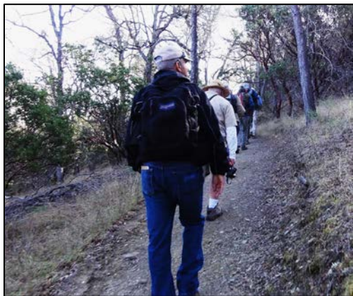
Hikers at Cache Creek (BLM)

In 2017, an interdisciplinary team was formed to identify areas where more information is needed regarding the resources, objects, values and stressors. Resource data is being compiled for use by both agencies.