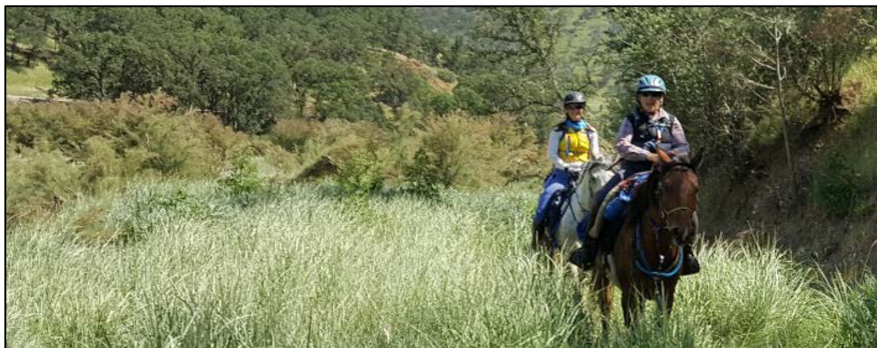
Equestrian riders enjoying a sunny day at the 2017 Annual Cache Creek Ridge Run.

Privately sponsored equestrian and motorized events continue to draw visitors to the area. The Sheetiron 300 Dual Sport Motorcycle Ride occurred on May 20-21, 2017. This event began at the Stoneyford Rodeo Grounds, and traveled along dirt roads in the monument to arrive in Fort Bragg, and back again the next day. The North Bay Sawmill Enduro April 2, 2017 hosted a picnic at Cowboy Camp, and the Cowbell Enduro was hosted on USFS lands.