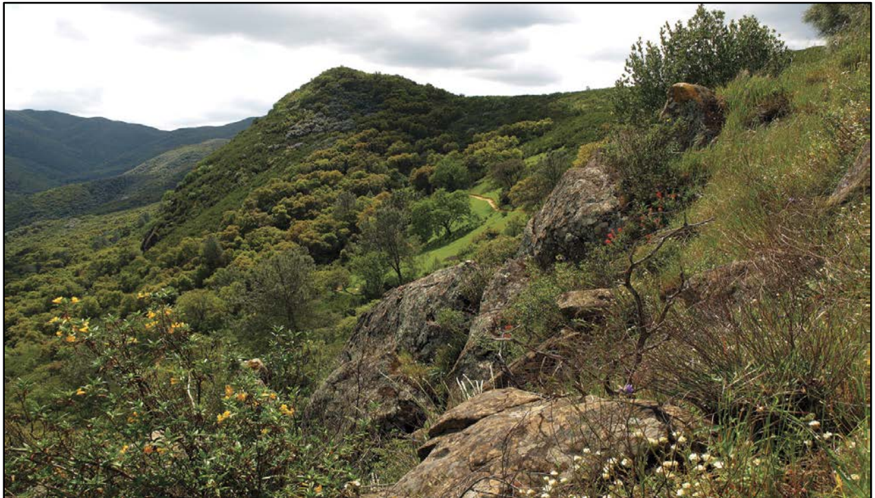
Beautiful vistas are abundant within the Cache Creek, Snow Mountain, and Cedar Roughs Wilderness Areas of Berryessa Snow Mountain National Monument.