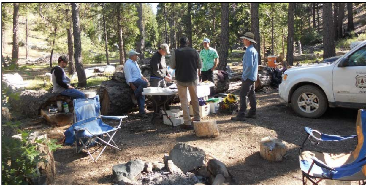
Volunteers gathered at West Crocket Campground to coordinate work for PIT Session 1.

PIT archeological survey projects alone logged 632 volunteer hours but many other volunteer contributions also supported the monument in 2017. Tuleyome coordinated hikes, and offered educational programming. Mendocino 4X4 Club volunteers installed two kiosks to provide information to recreational users in the monument. Hiking, equestrian, and OHV groups all contributed time bushing trails and helping federal agencies offer safe and enjoyable recreational experiences in Berryessa Snow Mountain National Monument.