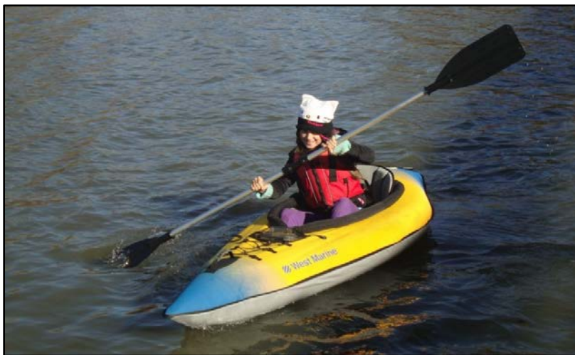
Recreational opportunities in the National Monument.