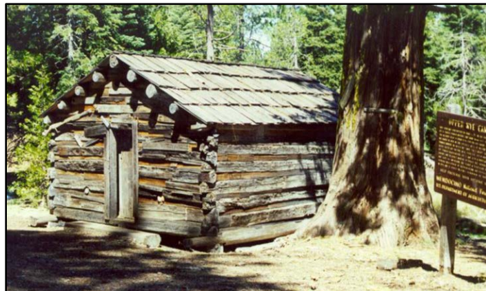
Historic Nye Cabin (USFS)