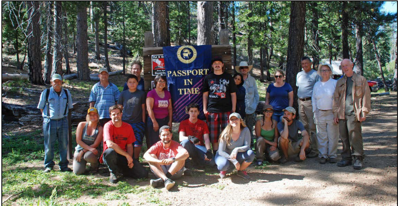
Passport in Time Volunteers from the first work session in the Snow Mountain Wilderness

To facilitate trail maintenance, volunteers helped conduct archeological surveys in the Snow Mountain Wilderness. Backcountry Horsemen Association provided pack support for these surveys. USFS staff also provided on the job survey training for volunteers through the Passport in Time (PIT) program. Thirteen PIT participants, worked alongside USFS staff, representatives from the Habematole Tribe of Upper Lake Rancheria, Round Valley Indian Tribes, and BLM staff. More than 400 acres were surveyed, new sites were recorded, and known site records were updated.