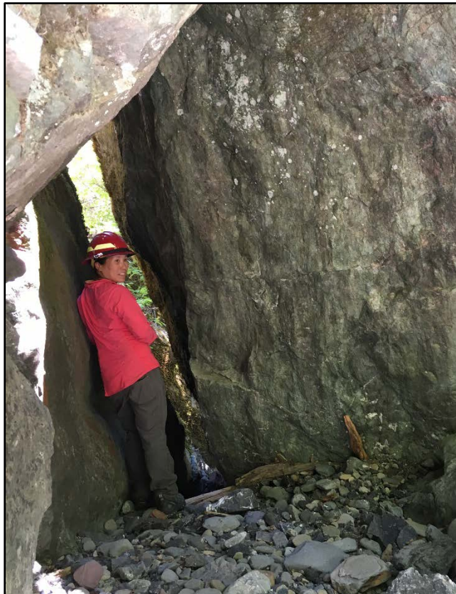
One of the caves that was surveyed in 2017.

The USFS also conducted a survey of caves within the monument in 2017. The monument has unique crevice and talus caves, which likely developed from mass wasting processes within Franciscan Assemblage bedrock. Other caves may have formed by seismic shaking along the Bartlett Springs Fault Zones and other Northern California Faults. The USFS Washington Office's Minerals and Geology Management provided special project funding for a reconnaissance level cave inventory. Eighty-nine outcrops were mapped remotely using LiDAR and high resolution satellite imagery. Thirty-six outcrops were visited over a span of two and half weeks, and seven new caves were discovered. One of these caves was especially impressive. The Flat Top Cave may be as big as 60 yards long, 30 feet deep, and up to 8 feet wide. The cave is set next to an incised stream and landslide. There are still more caves to discover, and other valuable resources that have yet to be found.