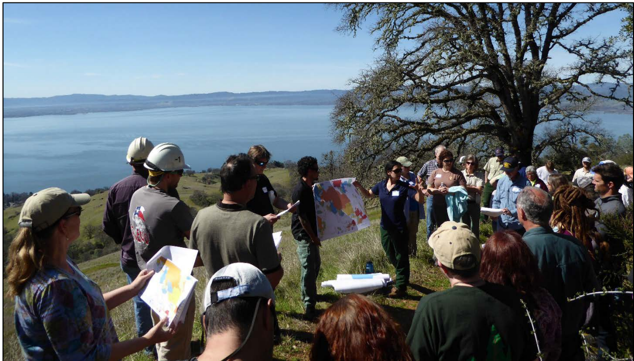
Wildland Fire behavior modeling discussion above Clear Lake.

Workshops, activities, and presentations of collaborative projects by USFS, Lake County Fire Safe Council, CAL FIRE and the North Shore Fire Protection District fostered conversations about land management and highlighted collaboration opportunities to establish fire resistant communities.