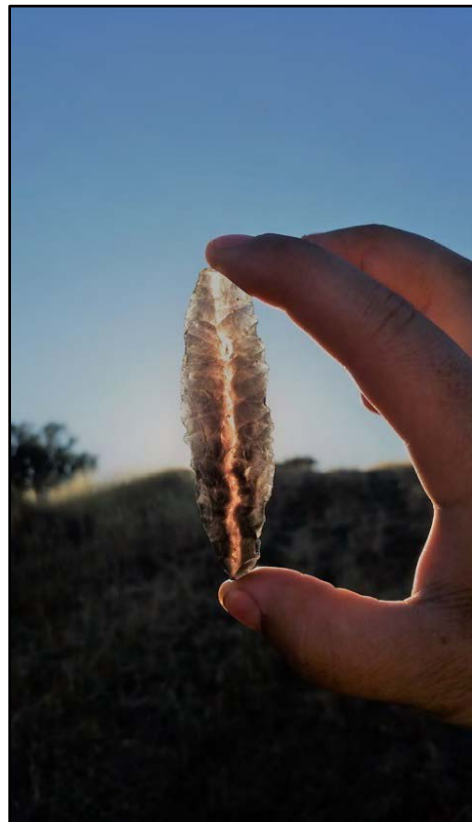
A Yellow Legged Frog and a flaked obsidian tool identified during resource surveys.