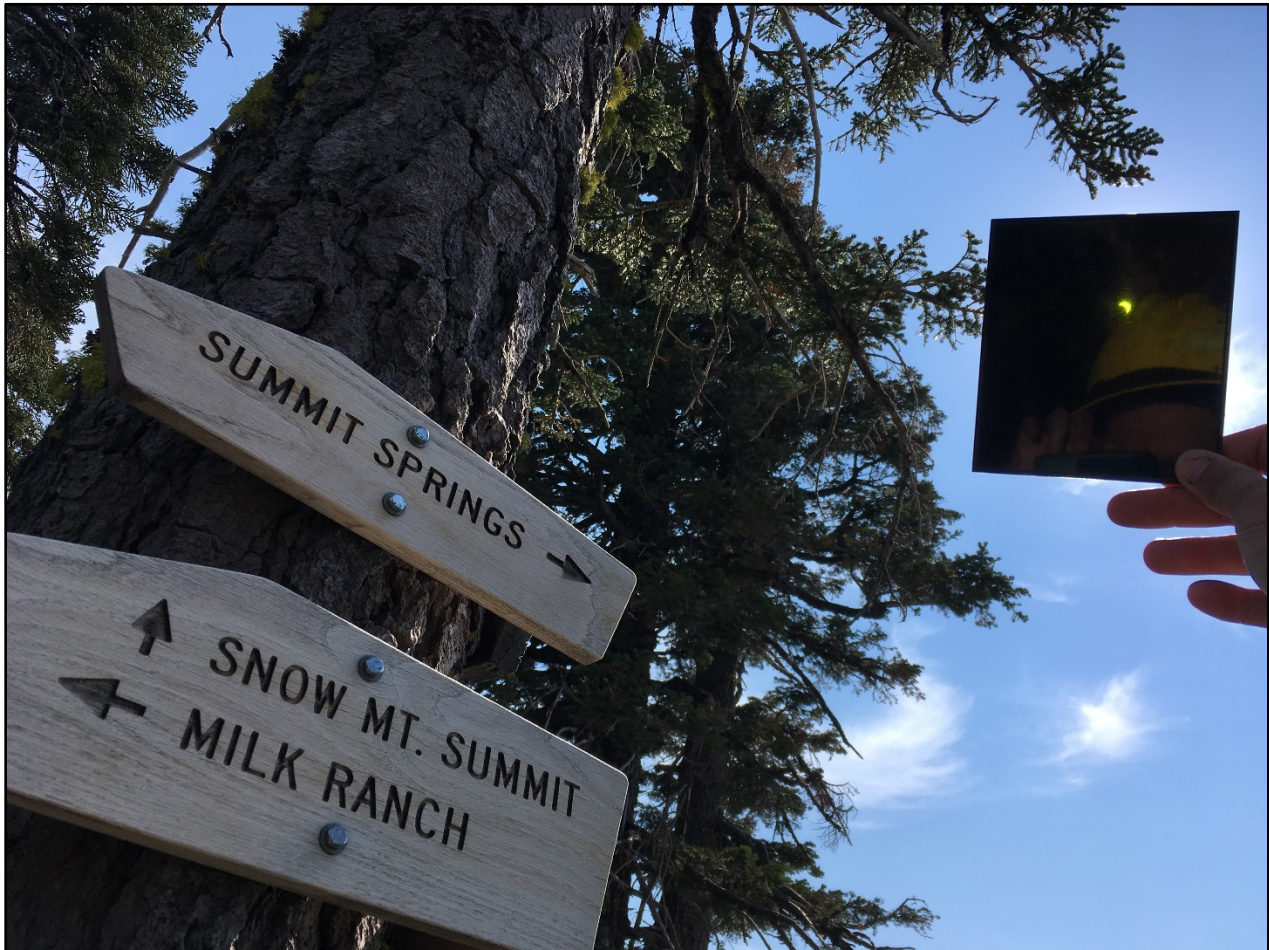
Snow Mountain was an excellent location to view the solar eclipse on August 21, 2017.

Berryessa Snow Mountain National Monument is still in the midst of Resource Management Planning efforts. Therefore, this section is not applicable at this time.