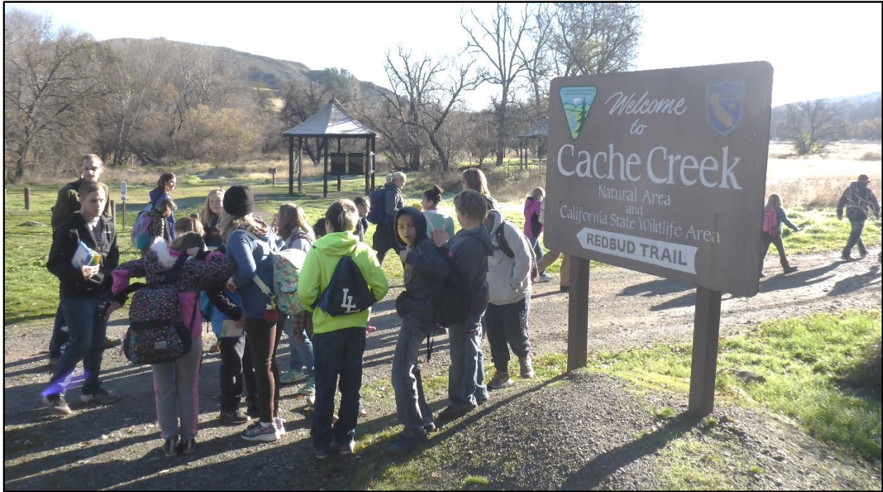
Students gathered at the Redbud Trailhead before a class trip.