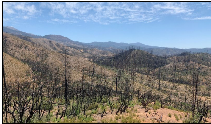
Figure 12. Postfire landscape in BSMNM.