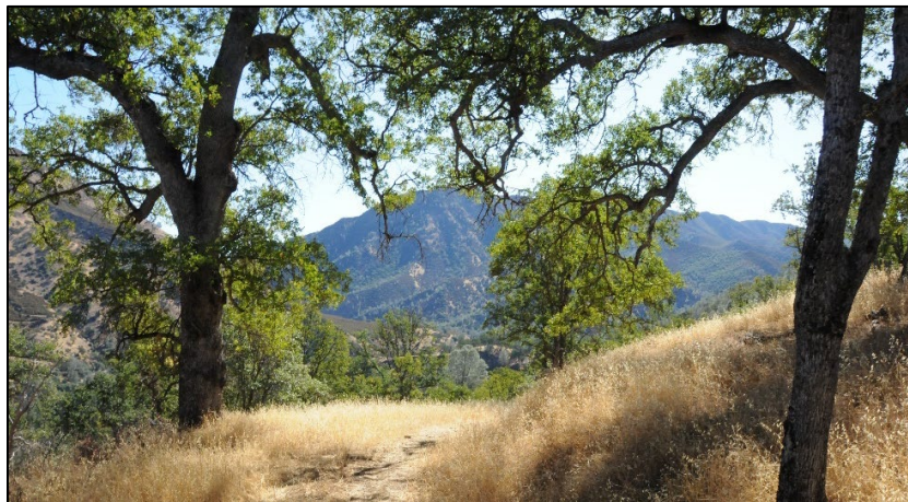
Figure 2. Frog Pond Trail before the 2020 fires.

Project and staff funding requests are evaluated on a case-by-case basis by each agency. In 2020, one intern was provided through the Hispanic Access Foundation (HAF) Resource Assistant program through an agreement between the Forest Service and HAF. Costs for the intern were provided by the BLM Ukiah Field Office. A second intern was provided by the American Conservation Experience (ACE) through the BLM Direct Hiring Authority program. A third internship hosted a student from California State University at Chico's Department of Recreation, Hospitality, and Parks Management. These interns worked side by side with agency staff to develop career skills and support the accomplishments outlined in this report.