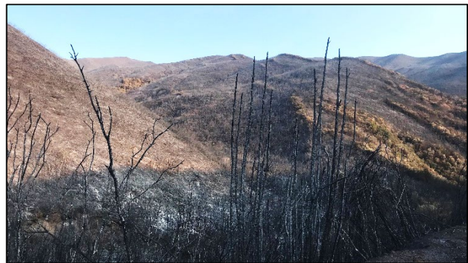
Figure 1. Post-fire of Cache Creek Natural Area.

Repairs and rehabilitation for 77,075 acres of burned federal lands within BSMNM will continue in 2021. Collaboration with Clear Lake Environmental Research Center (CLERC), University of California at Davis (UC Davis),