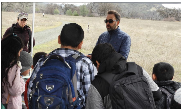
Figure 4. BLM Archaeologist hosting an interpretive station.

Continued collaboration with Tuleyome, CDFW, Mendocino National Forest, and the BLM Ukiah Field Office enable us to offer a field trip for fifth grade classes from Burns Valley Elementary school. Four interpretative stations were set up along the Redbud hiking trail. Groups of students visited each table to learn about various aspects of the Cache Creek Wilderness, and other resources within BSMNM. These stations included overviews about cultural resources, native plants, fire ecology, and wildlife. One station talked about the native plant community and how these plants sustained the native Hill Patwin, Pomo, and Miwok cultures for thousands of years. Another talked about ecological practices that support a healthy and productive land-base. Each child had an opportunity to hike in the wilderness before eating lunch and heading back to the school.