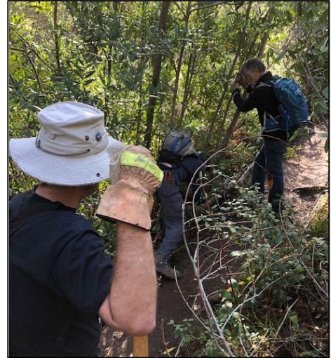
Figure 7. Volunteers at Stebbins Cold Canyon.

U.C. Davis and Tuleyome hosted volunteer events to help assess and repair fire damaged trails that provide access to national monument lands in the Stebbins Cold Canyon area. Their contributions rallied more than 160 volunteers in support of trail repair, trail maintenance, and public programs. Several volunteer workdays were hosted early in the year and some of the post-fire assessment work was also done by volunteers.