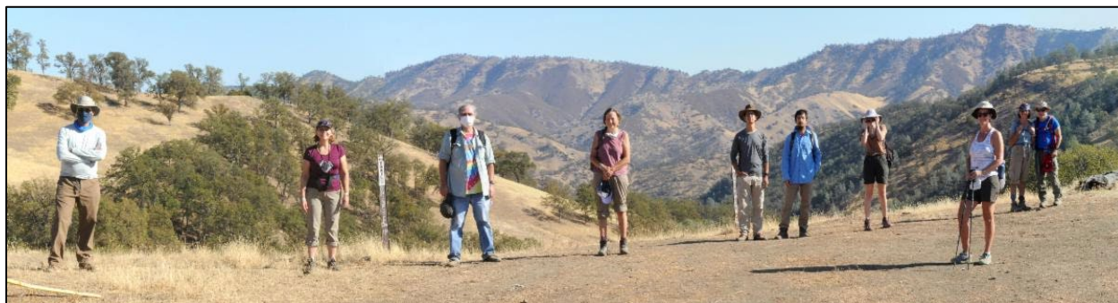
Figure 3. Partner guided hikes used face masks and social distancing for safety.

Tuleyome hosted guided hikes at the Judge Davis Trail, Annie's Trail, and offered an overnight camping trip as well. BLM once again hosted the annual Bald Eagle Hikes into the Cache Creek Wilderness. Several guided hikes were cancelled due to county and state mandated covid restrictions, but when they were offered again mask and social distancing within family groups to provide a safe and educational outdoor experience.