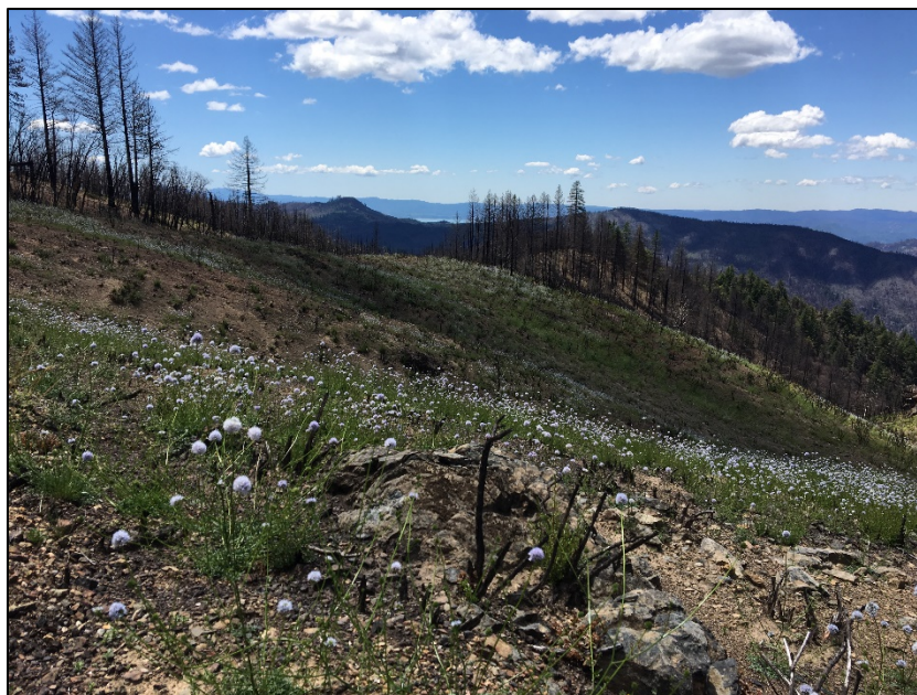
Figure 13. View of Mendocino National Forest wildflowers the after the Ranch Fire.