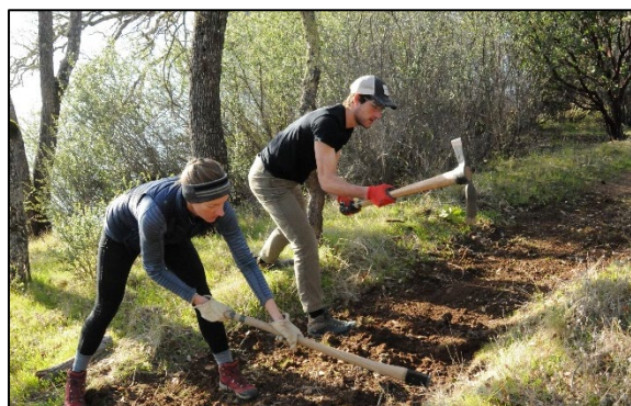
Figure 6. Maintaining trails.

Collaboration with more than 40 groups enables us to support community-based outreach and focus on programs and projects that are highly valued by those communities. A few of the key partners who made significant contributions to the accomplishments in this report are identified in the following section.