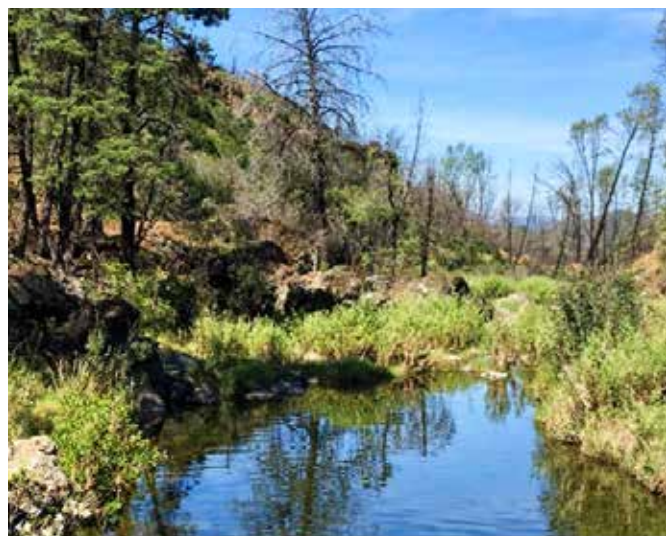
Cache Creek is listed as a California Wild and Scenic River.

BSMNM offers a remote and often wild experience. There are three designated wilderness areas in the BSMNM: Snow Mountain, Cache Creek, and Cedar Roughs. These wilderness areas host opportunities for study and education. They also offer hiking and camping opportunities in a wilderness setting with minimal human influence. Cache Creek is a beautiful free-flowing stream, which is designated as a Wild and Scenic River under the California Wild and Scenic Rivers Act (2005). Cache Creek was also recommended as suitable for the National Wild and Scenic River System in the 2006 BLM Resource Management Plan. When venturing into wilderness areas, let someone know where you are