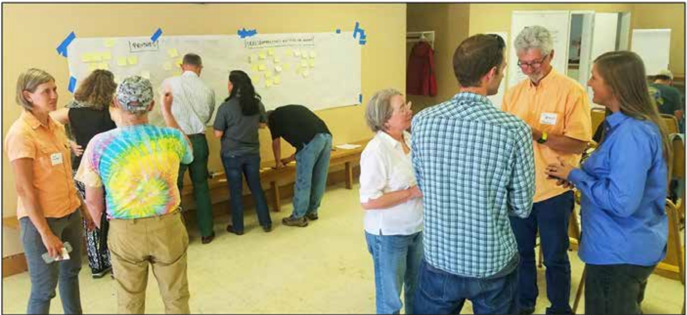
Recreation, Volunteerism and Stewardship Workshop in Napa, CA.

proclamation that established the BSMNM. This guide incorporates information from community conversations and workshops, plus it includes information provided by individuals and non-government organizations. More information about the Community Conversations is available online at the Mendocino National Forest website. More information about the recreation, volunteer and stewardship workshops is available online in the Monument News section of the BLM National Conservation Lands website for BSMNM.