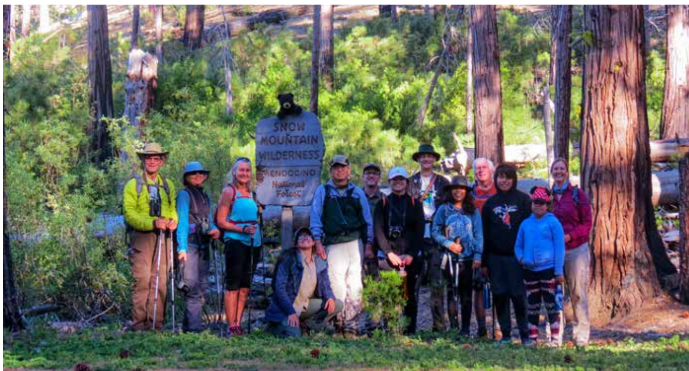
Snow Mountain Wilderness hikers; West Crocket Trail guided hike.

Federal agencies continue to seek input regarding the management of monument lands. Your ideas, comments, concerns, and suggestions are always welcome. Please contact the Berryessa Snow Mountain National Monument Manager at BLM_CA_BSM_NM@BLM.Gov to participate in our next steps as we move forward, working with partners and communities to ensure the successful management of Berryessa Snow Mountain National Monument.