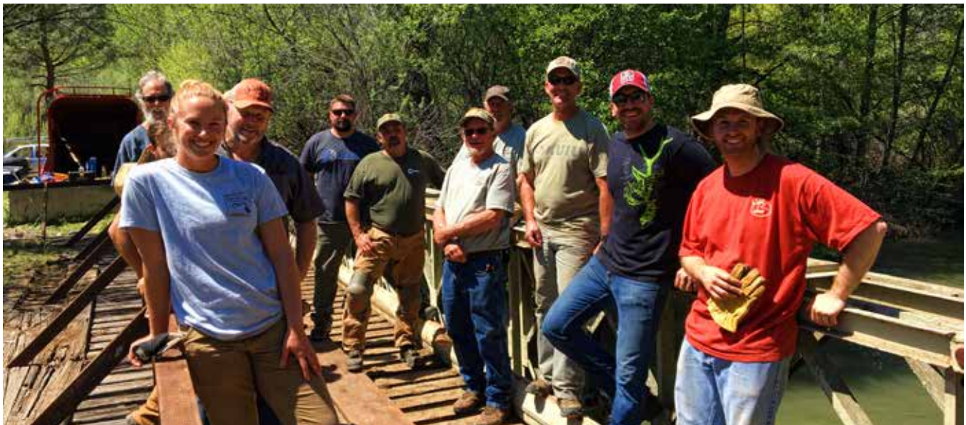
Rocky Mountain Elk Foundation volunteers on the Indian Creek Bridge.

several online resources. Volunteer opportunities throughout the nation are posted online at the www.volunteer.gov website, but the best way to offer your help is to contact the agencies directly. The monument currently offers volunteer opportunities for site stewardship, career development internships, post-fire rehabilitation projects, infrastructure maintenance, and educational program docents. A sample volunteer application form ( https://go.usa.gov/xyE8X ) and interagency volunteer agreement form ( https://go.usa.gov/xyE85 ) are available online. New volunteers are welcome to reach out to the monument manager at BLM_CA_BSM_NM@BLM.Gov . The help provided by dedicated community members and volunteer groups is a key to successful implementation of monument projects.