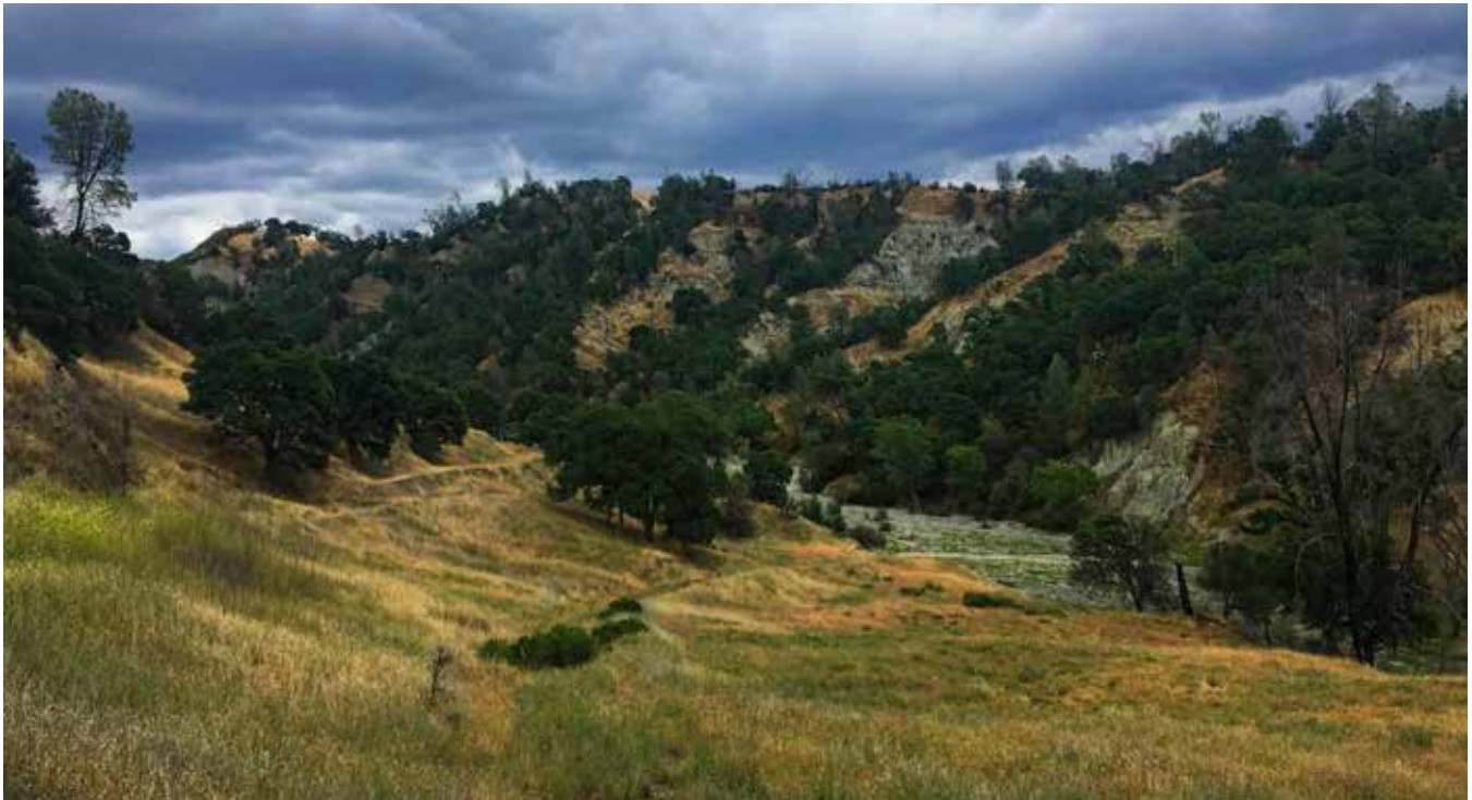
Indian Valley accessed from the Indian Creek Bridge.

lines, and be aware of private property lines. Signage and fencing that were apparent before the fires may be more difficult to identify now. Walker Ridge Road and Bartlett Springs Road traverse the ridge top, and offer views of the reservoir, Bear Valley, and surrounding areas. These graded gravel roads provide boat access to the reservoir and access to monument lands of Mendocino National Forest. More information is available online from Lake County ( https://lakecounty.com/place/indian-valley-reservoir/ ) and the BLM ( https://go.usa.gov/xyEkr ).