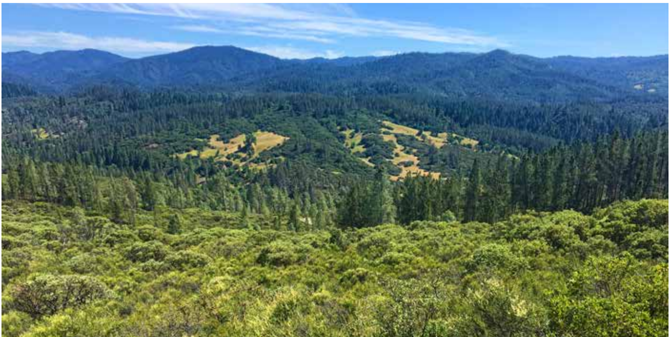
Overlooking the Snow Mountain Wilderness.

The BSMNM incorporates public land managed by two federal agencies that work closely with other partners. These partnerships provide collaborative opportunities for resource management, enhanced recreational opportunities, and potential to further local economic development. This guide also provides information about volunteer opportunities. It summarizes suggestions provided in public meetings and proposes avenues for federal agencies to work with communities and partners toward a shared management vision. Periodic updates to this guide will reflect BSMNM progress and incorporate new opportunities. Public comments and suggestions are welcome at Berryessa Snow Mountain National Monument.