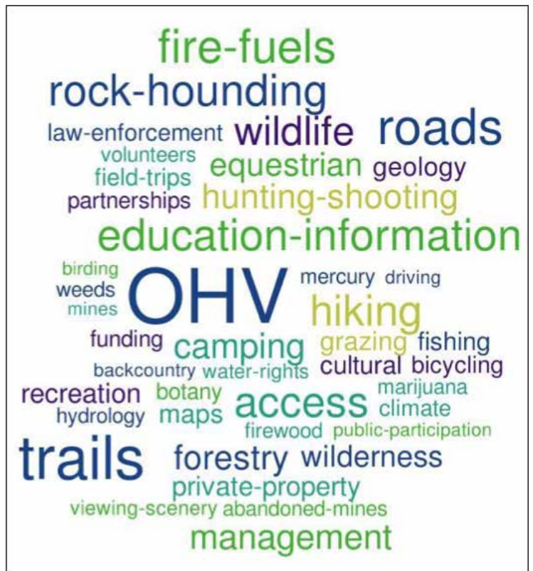
The size of each word corresponds to how often it was used in 2016 meeting comments.

In 2018, a series of public workshops focused on gathering additional information to develop a shared vision for enhancing the capacity to work with volunteers and partners. These Recreation, Volunteerism, and Stewardship Workshops conveyed agency policies, celebrated partner successes, shared each partner's unique vision, and identified the types of expertise needed to make our shared vision a reality.