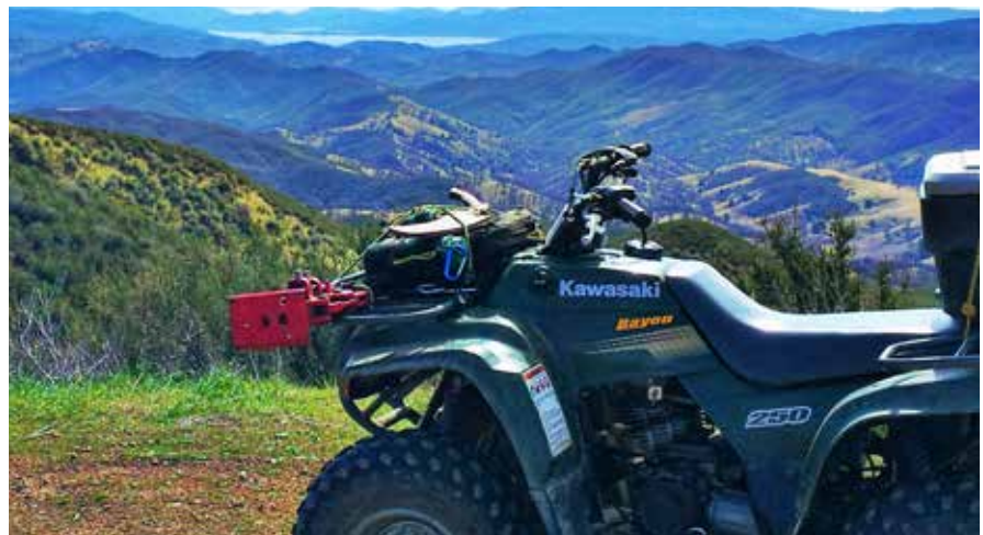
OHV access to scenic monument overlooks.

Campfire permits are not required for camping within developed USFS campgrounds, but they are required for all dispersed camping on USFS lands and they are required for all camping on BLM managed lands. "Dead and down" wood may be used for campfires. Local fire restrictions supersede the campfire permit, so please check