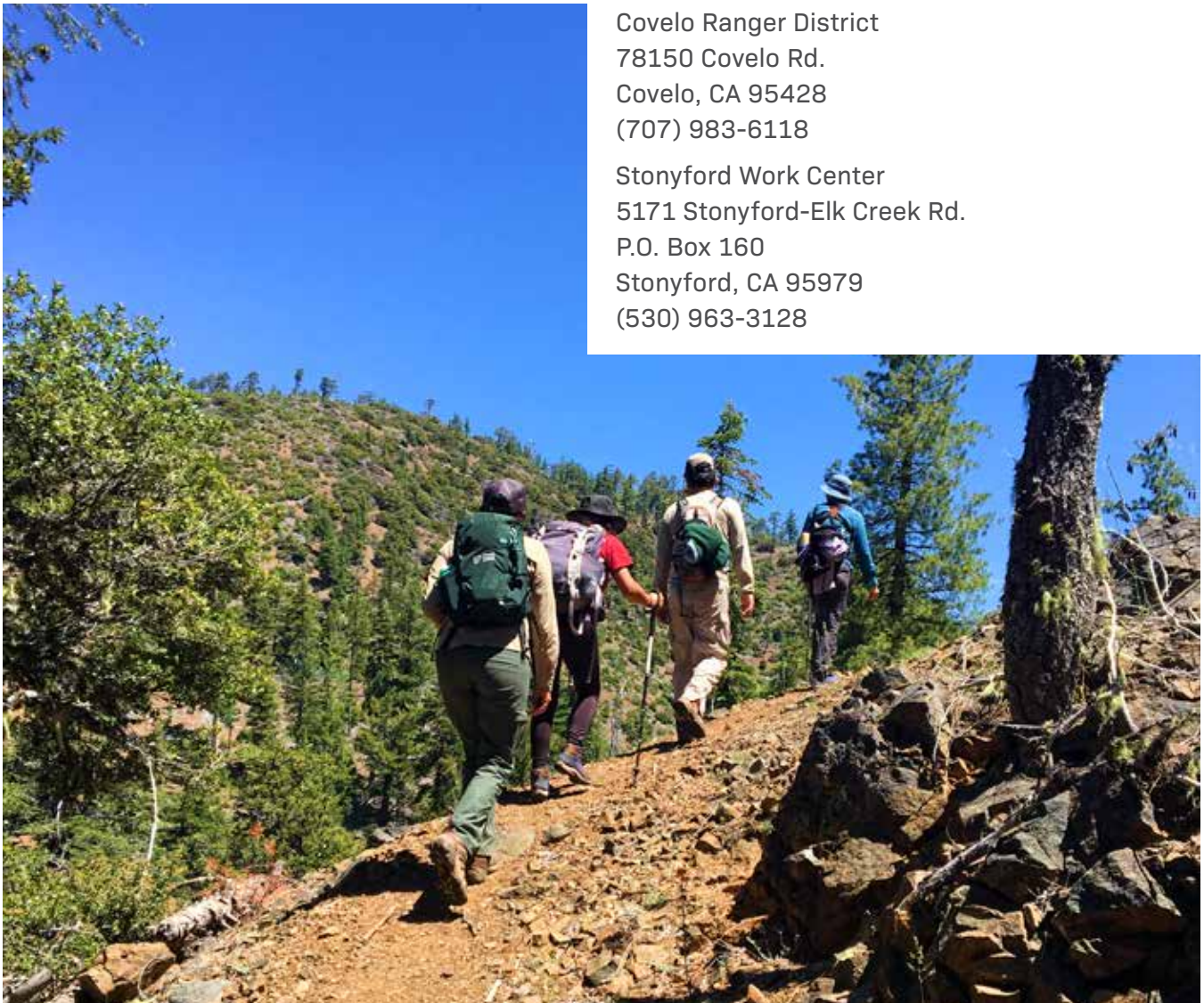
Hiking the West Crocket Trail in the Snow Mountain Wilderness.