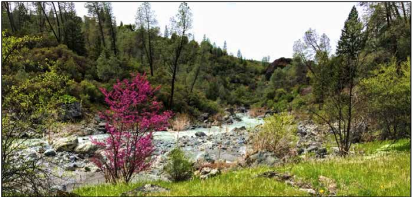
Eel River with redbud tree in the Snow Mountain Wilderness.

Stoney Creek to 7056' on the summit of East Peak. Snow Mountain Wilderness burned in the 2018 Ranch Fire and trail conditions may be difficult. Some trailheads may be unavailable to parking due to hazard trees in the vicinity. Camping is available at Lower Nye, West Crocket, Summit Springs, and Bear Creek campgrounds. A network of trails provides access to stunning views, forested areas, waterfalls, and recreational opportunities. More information about the Snow Mountain Wilderness ( https://go.usa.gov/xyEDw ) is available online from Mendocino National Forest.