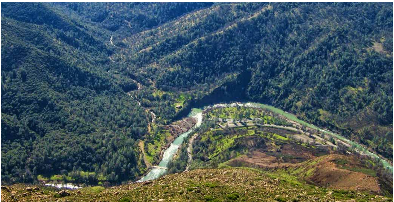
Hiking the intercostal range mountains of BSMNM.

The proclamation identifies numerous resources, objects of interest, and values for the management of this monument. Native American cultural legacies continue to be relevant for the management of this landscape. Important cultural resources date back to prehistoric times and others date back to periods of European settlement. Natural landmarks and unique features illustrate a dynamic geological story. Prominent rivers have helped to shape this landscape and the diverse habitats within it. The proclamation describes many examples of diverse and unique species that are endemic to the Berryessa region. The BSMNM also provides exceptional educational and research potential.