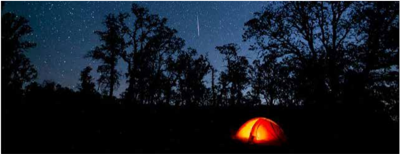
Camping under the stars in BSMNM.

Additional resources are available at the Mendocino National Forest Recreation website ( https://go.usa.gov/xyE4k ), BLM Ukiah Field Office website ( https://go.usa.gov/xyE4X ), and at the Recreation.gov website ( https://go.usa.gov/xyE4U ). Regional trail information can also be found at the Tuleyome website ( http://tuleyome.org/trails/ ) link from the BLM National Landscape Conservation System (NLCS) Berryessa Snow Mountain National Monument website ( https://go.usa.gov/xyE4p ).