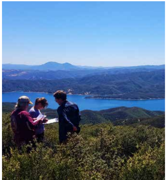
Collecting resource data in Berryessa Snow Mountain National Monument.

In 2016, the USFS and BLM formed an interdisciplinary team of resource specialists to assess existing agency policies, land and resource management plans, and available resource data. This team identified key resources, objects and values from the Presidential proclamation.