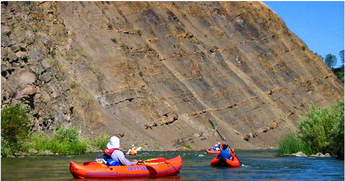
Kayaking on Cache Creek to see some geological stratigraphy.

Cache Creek Wilderness ( https://go.usa.gov/xyEk3 ) is available online from the BLM. Developed campgrounds are also available on adjacent lands managed by Yolo County. Information about Cache Creek Regional Park Campground is available online ( https://www.yolocounty.org/government/general-government-departments/parks/cache-creek-regional-park-campground ).