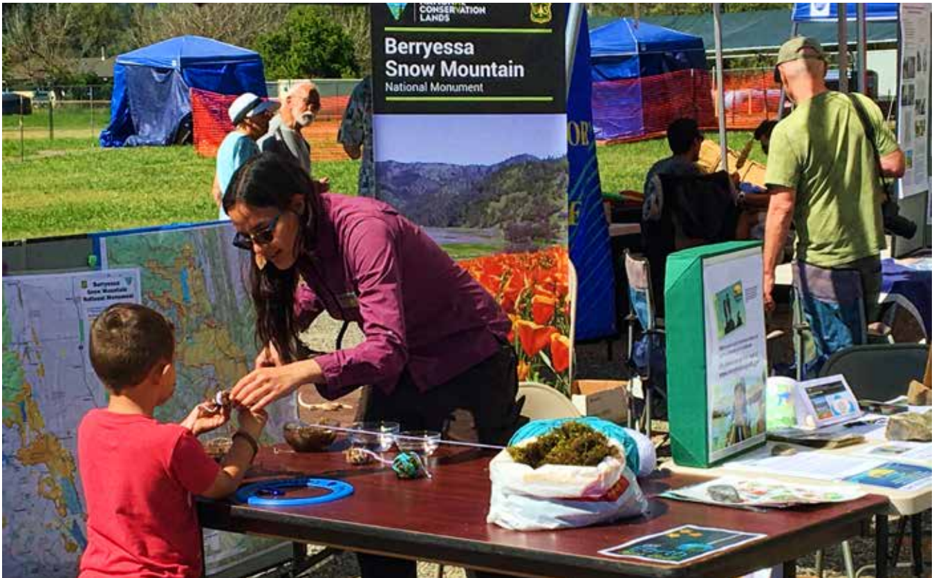
National monument information booth at an Earth Day festival hosted by the Habematolel Pomo of Upper Lake.