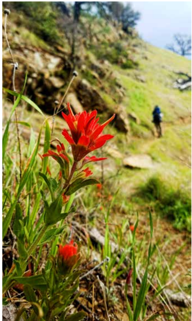
Hiking in the vicinity of Berryessa Peak before the County Fire of 2018.

USFS fuels reduction treatments that the Ranch Fire burned through. This monitoring allows the agency to evaluate treatment effectiveness to help in future program management, project planning and implementation. BAER reports characterized fire impacts and recommended emergency stabilization and rehabilitation actions. A study of post-fire chaparral recovery from the 2015 Rocky and Jerusalem fires that burned BLM lands is another source for resource-based data. Both agencies are utilizing these recent studies in their efforts to implement the BAER recommendations. Volunteer opportunities to assist with fire rehabilitation are available. Please contact us if you are interested in helping.