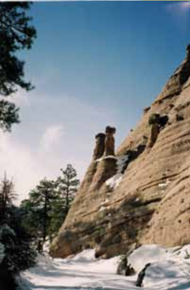
A spring snowfall blankets the canyon trail.

Snacks, water, soda, sandwiches and gas can be obtained at the convenience store located near the town of Cochiti Lake. Camping, boating facilities and RV hookups are available at the Cochiti Lake Recreation Area.