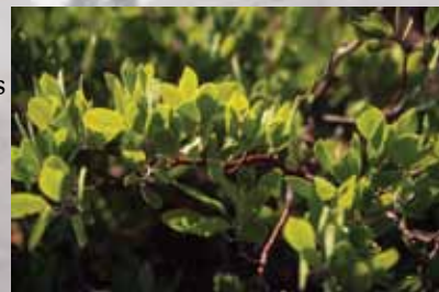
Manzanita—used for medicinal purposes by Native Americans.

In the midst of the formations, clinging to the cracks and crevices high on the cliff face, the vibrant green leaves and red bark of the manzanita shrub stand in sharp contrast to the muted colors of the rocks. A hardy evergreen, the manzanita produces a pinkish-white flower in the spring that adds to the plant’s luster. Other