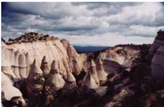
A beautiful view from atop the Canyon Trail.