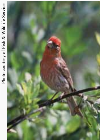
The House Finch is commonly seen at Tent Rocks – the male has a bright red chest while the female is brown with bold streaks.

Depending on the season, you are likely to see a variety of birds. Red-tailed hawks, Ruby-crowned Kinglets, House Finches, violet-green swallows, Hepatic Tanagers, and an occasional golden eagle soar above the area or use piñon-covered terrain near the cliffs.