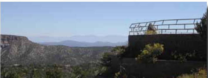
From the Veterans' Memorial Scenic Overlook, you can see spectacular vistas of Camada and Peralta Canyons, the Dome Wilderness, and Jemez Mountains.