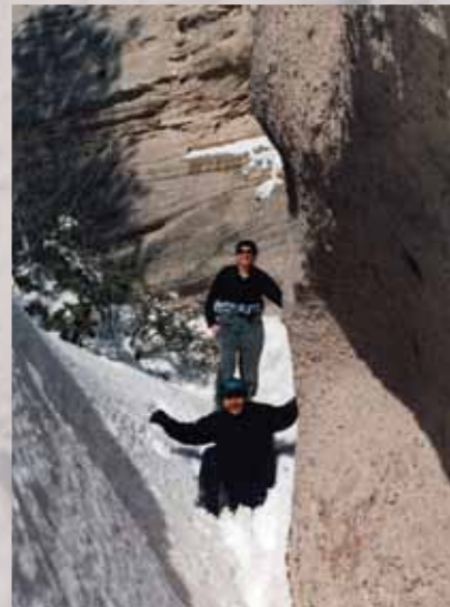
Hikers enjoy all seasons at the monument.

Glass containers can be hazardous and are best left at home. View the national monument on foot; to reduce erosion, stay on the designated trail. Motorized vehicles and mountain bikes are permitted only on the access road and designated parking areas. Please observe the posted speed limit.