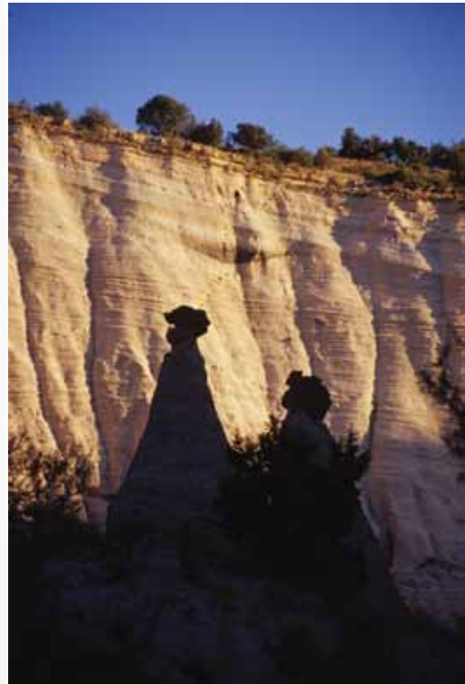
The boulder “cap” protects the fragile tent-shaped formation beneath it.

The Pueblo de Cochiti has always considered this area a significant place. “Kasha-Katuwe” means “white cliffs” in the