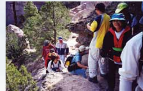
The Monument serves as an outdoor laboratory for educational groups.

The National Recreational Trail is for foot travel only, and contains two segments that provide opportunities for bird-watching, geologic observation and plant identification. Both