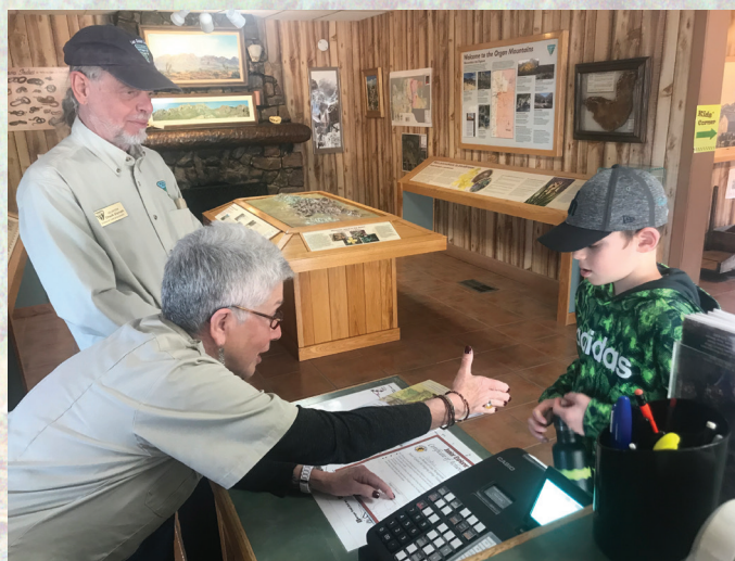
Volunteers greet guests at the Visitor Center located at the Dripping Springs Natural Area

The Monument has lured people for hundreds of years. It has been a homeland for diverse Native American people, Van Patten's historic hotel, the Butterfield Stage Coach Line, a place of exploration for 17th century Spaniards, a hideout for one of the American West's most notorious outlaws, and a training ground for World War II airmen and Apollo astronauts. The area is also home to a high diversity of animal life, including golden eagles and other raptors, as well as mountain lions, mule deer, and other mammals.