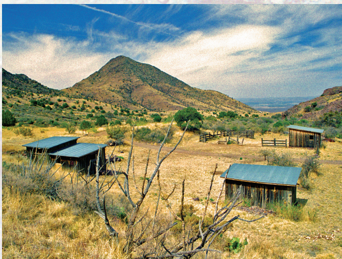
Livery Ranch Buildings

The Potrillos Mountains, 30 miles southwest of Las Cruces, are a series of cinder cones with maar craters and basalt lava flows in an open Chihuahuan desert landscape. Its oldest maar crater is thought to be the mile-wide Kilbourne Hole, at more than 80,000 years old.