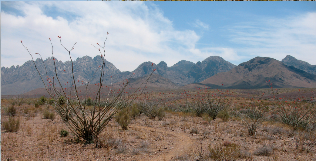
North segment of the Sierra Vista Trail