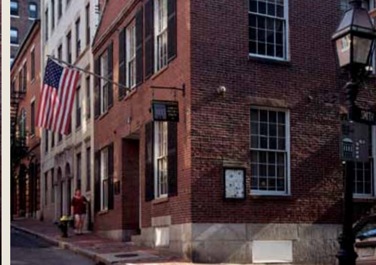
Abiel Smith School at Smith Court

The African Meeting House, built by free black laborers in 1806, is activity for Boston's free black 1800s a Jewish congregation African American History.