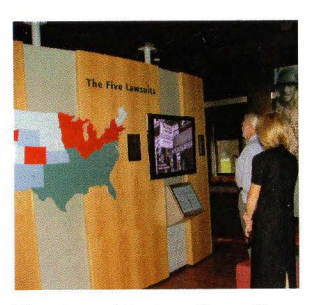
Education and Justice gallery with an interactive exhibit displaying the five lawsuits.

Monroe Elementary School was one of four segregated elementary schools for African Americans in Topeka. Unlike Southern states that required segregation, Kansas law only permitted segregation in elementary schools and only in cities with more than 15,000 residents. Linda Brown attended this school rather than Sumner School in her neighborhood because she was African American. Her father Oliver Brown and twelve other parents joined a lawsuit against the Topeka School Board in 1951. The case became known as Brown v. Board of Education .