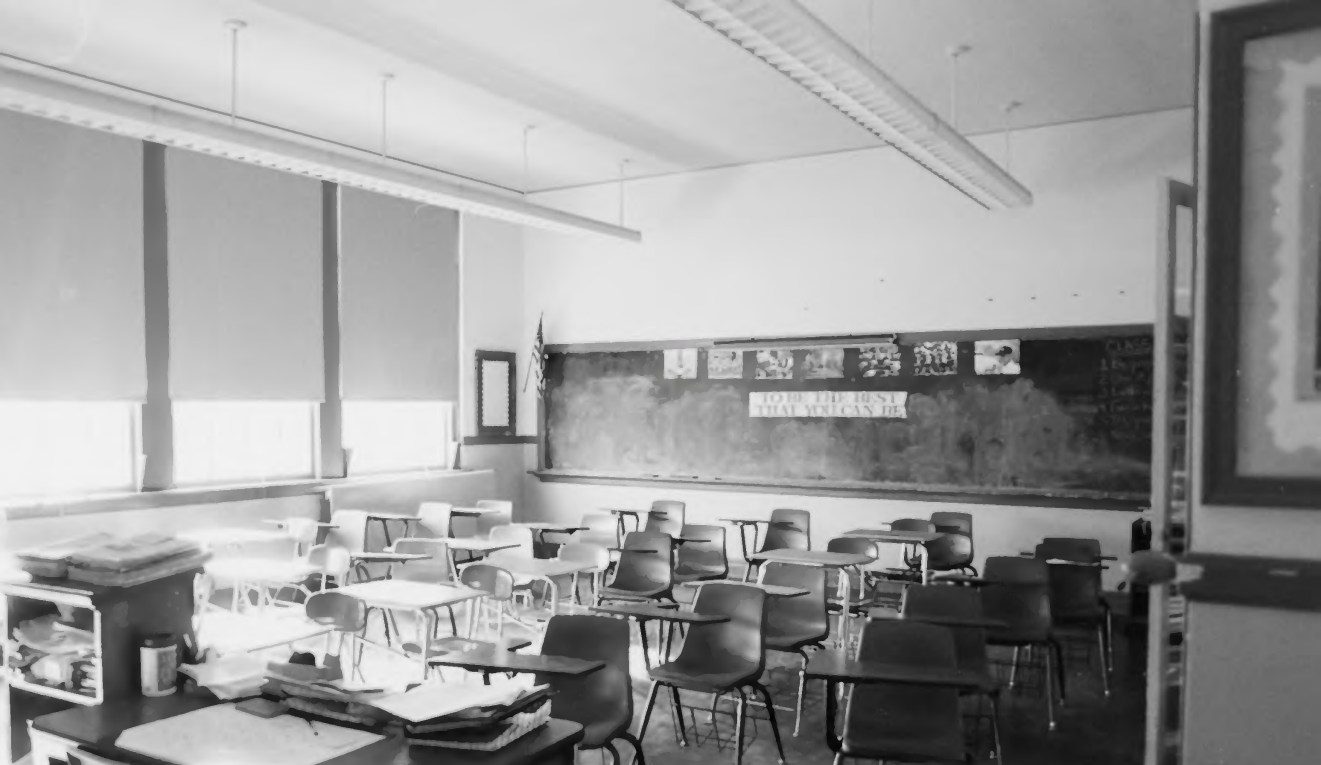
ROBERT R. MOTON HIGH SCHOOL, Farmville, VA Classroom