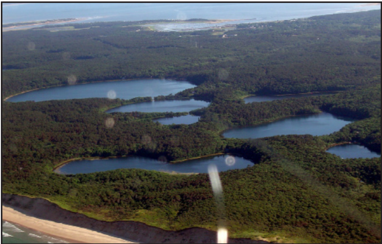
Gull Pond, top left, and other kettle ponds within the Cape Cod National Seashore. Gull Pond is connected in a chain to three other ponds by small artificially maintained sluiceways, and ultimately to the Cape Cod Bay via the Herring River outlet.