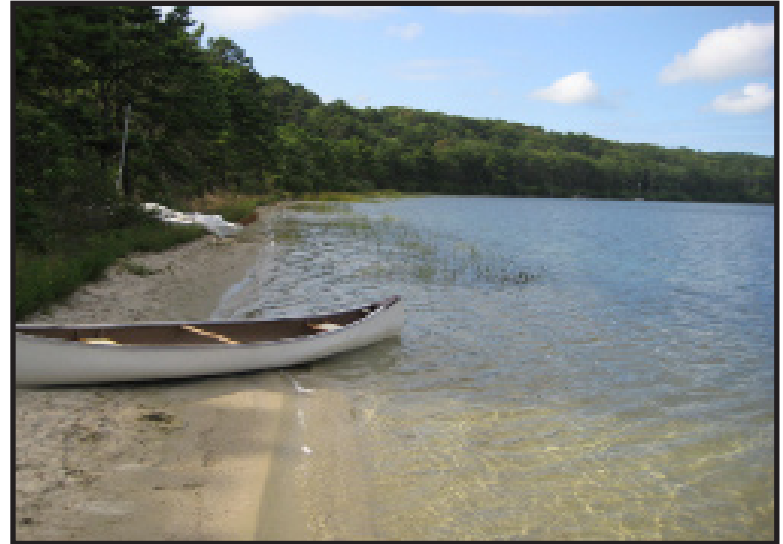
Gull Pond shoreline, Wellfleet, Massachusetts.

The Cape Cod Ecosystem Monitoring program seeks to identify and understand long-term changes in hydrologic, chemical, and biological features of ponds, salt marshes, and estuaries that occur in Cape Cod National Seashore. The long-term monitoring program provides critical data for understanding changes in these ecosystems related to climate change. Many ecosystems within the Cape Cod National Seashore are vulnerable to the increases in air temperature, precipitation, and sea level that are projected in future decades (Frumhoff et al. 2007). Monitoring of vegetation in coastal marshes, amphibians in wetlands, and water quality in permanently flooded kettle ponds are the longest standing programs at Cape Cod National Seashore going back as far as the 1950s. Estuarine water quality and nekton monitoring have been added to the Cape Cod Ecosystem Monitoring program in recent years.