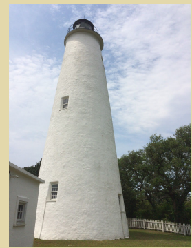
Ocracoke Lighthouse History

Inclement weather may impact lighthouse climbs and other interpretive programming.