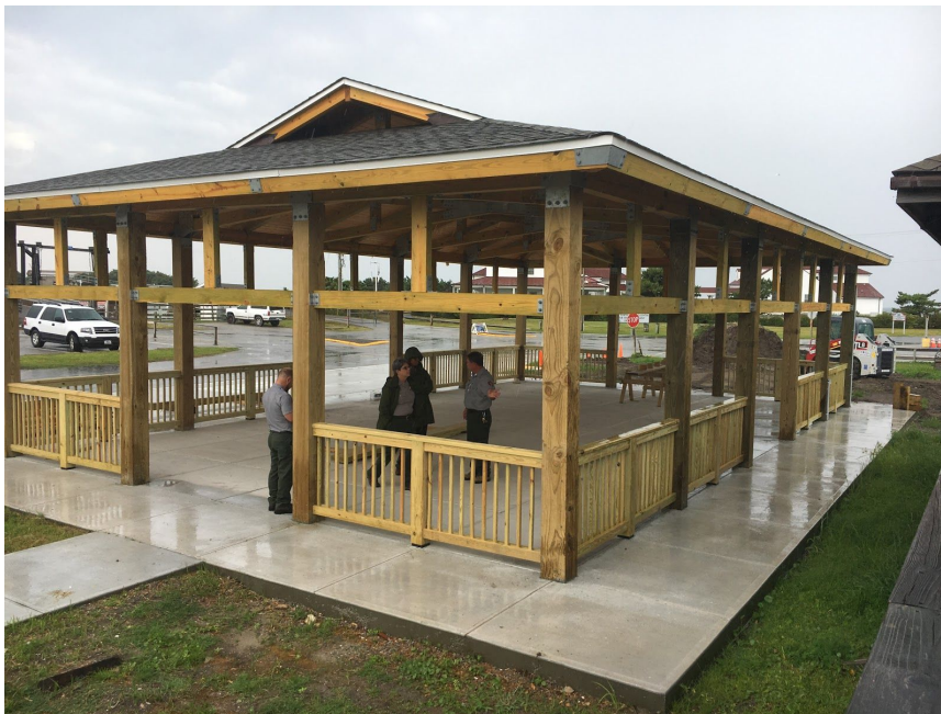
Recent photo of the new Ocracoke passenger ferry shelter.