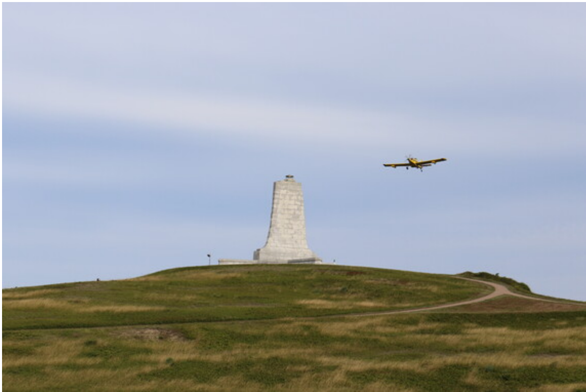
An N.C. Department of Agriculture plane flies over Wright Brothers National Memorial.