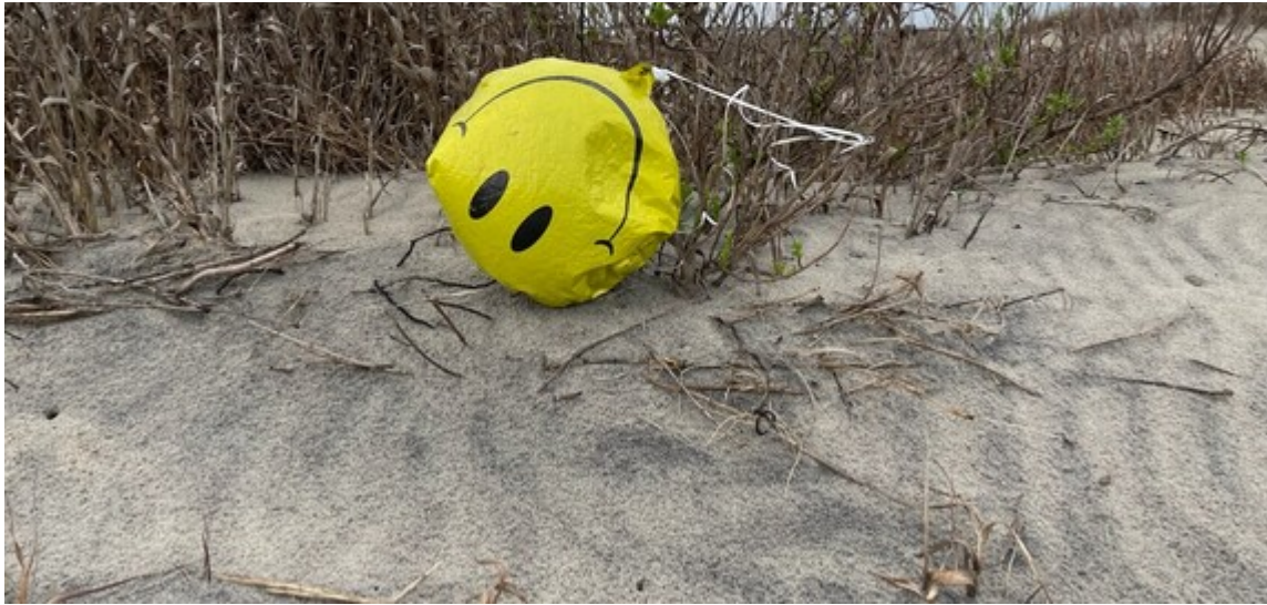
Cape Hatteras National Seashore staff collected 370 balloons last month. 938 balloons were collected in the first five months of 2023.