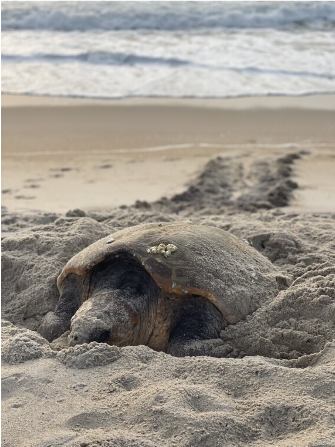
A loggerhead sea turtle nests at sunrise on Hatteras Island.