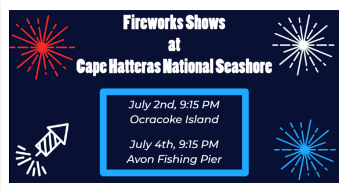
Cape Hatteras National Seashore wishes its visitors a happy and safe Fourth of July weekend. Organizers of two fireworks shows have received permits to celebrate Independence Day.