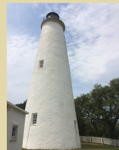
Ocracoke Lighthouse History