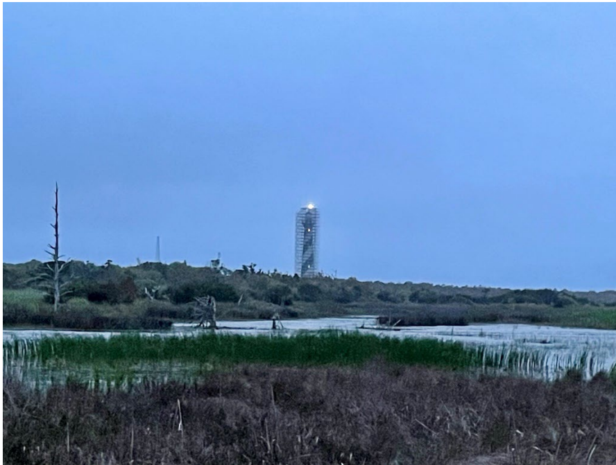
Photo of the temporary beacon at the top of the Cape Hatteras Lighthouse. The temporary beacon will be replaced with a replica first-order Fresnel lens near the end of the restoration project.