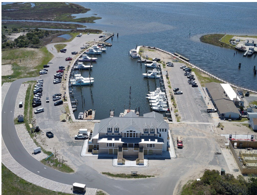
Aerial view of the replacement marina store and restaurant facility at Oregon Inlet Marina.