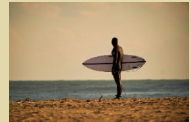
Cape Hatteras National Seashore