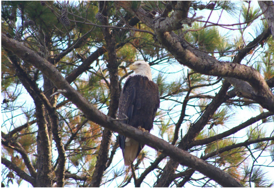
Bald eagle at Wright Brothers National Memorial.