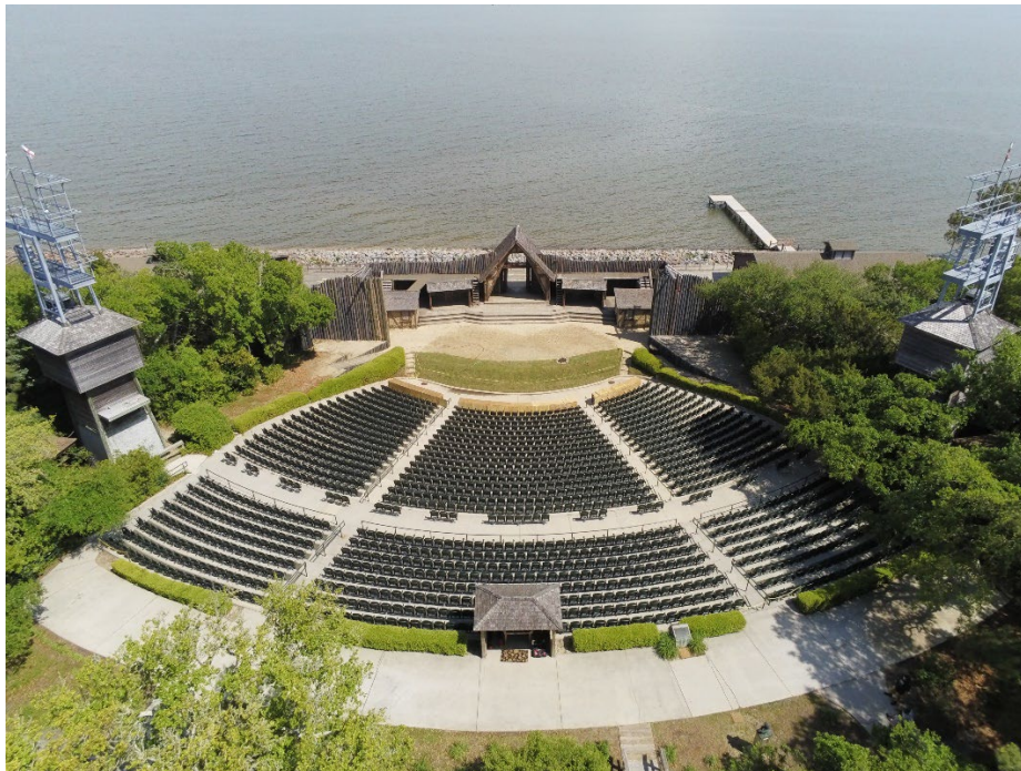
Aerial view of Fort Raleigh National Historic Site's Waterside Theatre.