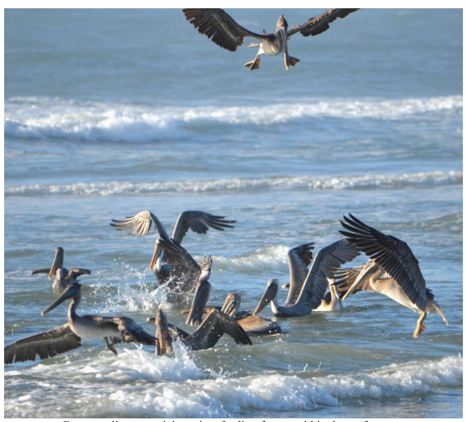
Brown pelicans participate in a feeding frenzy within the surf zone.