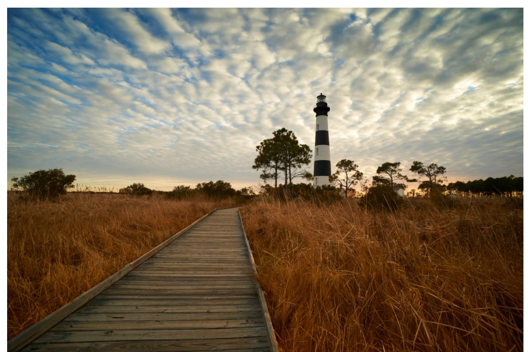
Who is ready to enjoy even more climbing opportunities at the Bodie Island Lighthouse? Evening and full moon climbs begin near the end of May.