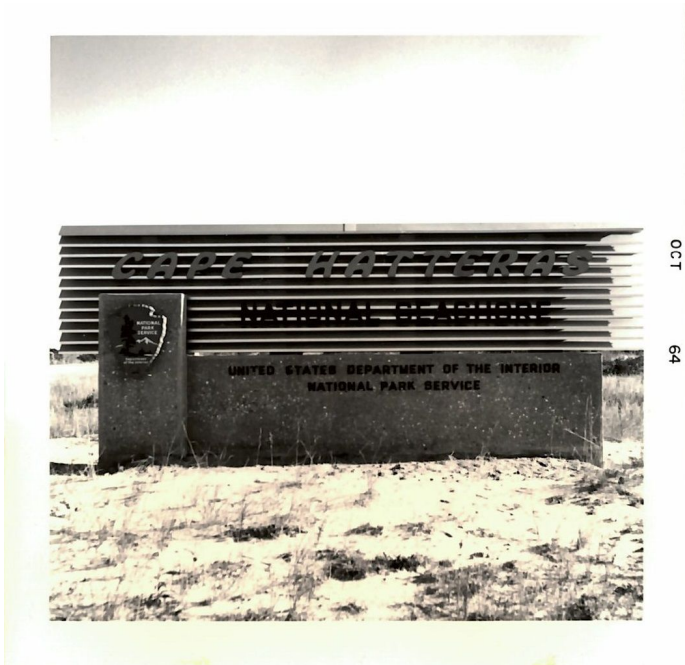
The original entrance sign at Whalebone Junction was designed by the Eastern Office of Design and Construction based in Philadelphia.

We hope you enjoy these photos of early Seashore signs that were a product of Mission 66 design.