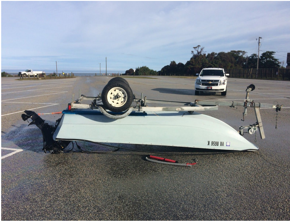
Photo of an overturned boat and trailer on Ocracoke Island the morning of November 13. The bad weather that impacted the Outer Banks the evening of November 12 and the morning of November 13 did not cause damage to any National Park Service facilities.