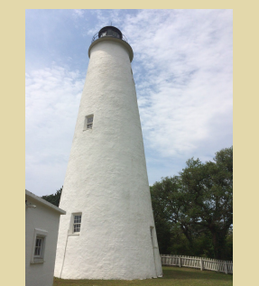
Ocracoke Lighthouse History