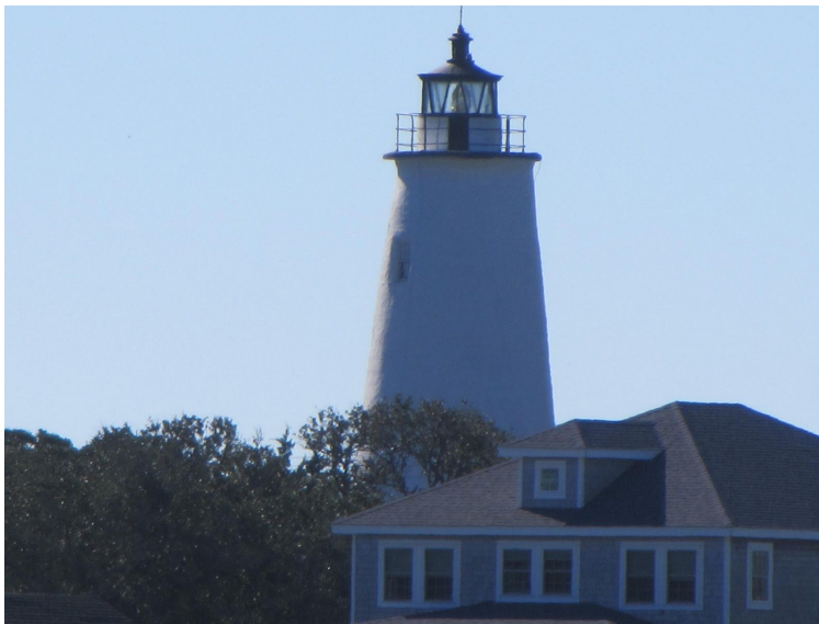
NPS photo from November 16, 2018