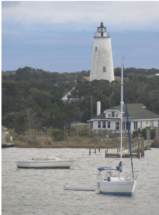
November 13, 2017

The cleaning of the Ocracoke Lighthouse was recently completed. Check out the before and after photos below.