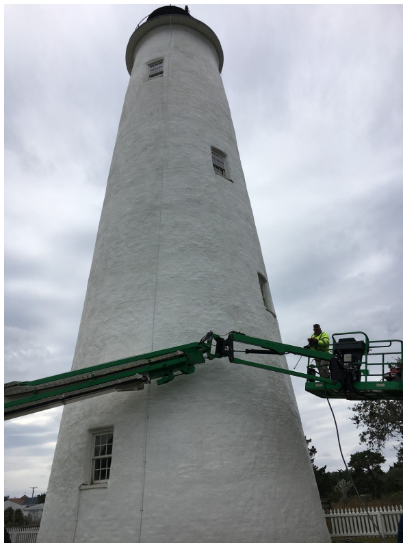
The Ocracoke Lighthouse was cleaned by Seres Engineering & Services LLC of Mount Pleasant, South Carolina.