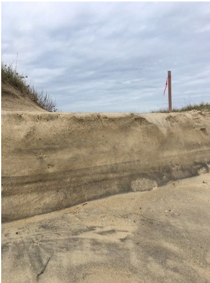
A steep sand cliff has formed at the entrance to off-road vehicle ramp 30. The cliff has caused a temporary closure of the ramp.