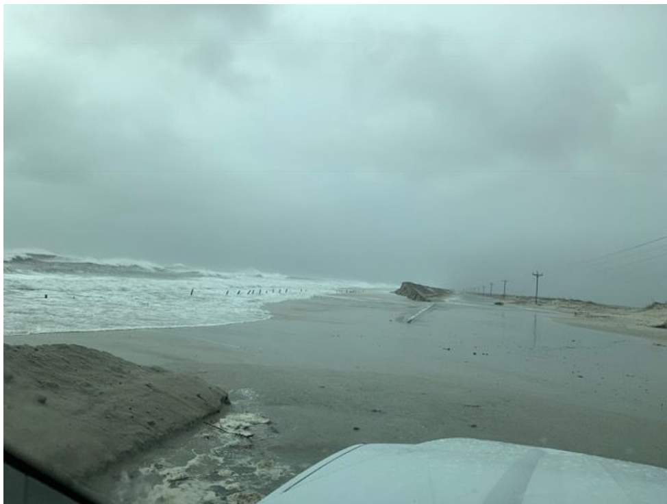
Winter Storm Diego brought strong winds, heavy rain, and ocean overwash to the Outer Banks. A dune breach on Ocracoke Island is shown in the photos above and below. The National Weather Service reported 70 mile per hour gusts of wind on Ocracoke Island.