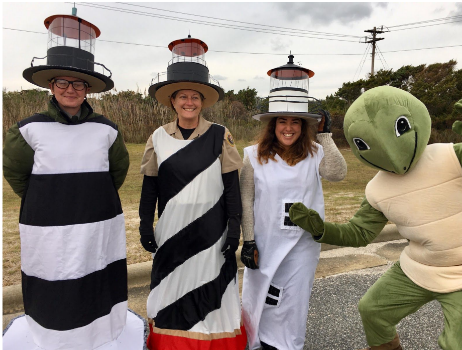
Seashore staff and volunteers really enjoyed participating in last Saturday's Hatteras Christmas Parade. Thank you for your support along the parade route and on social media!