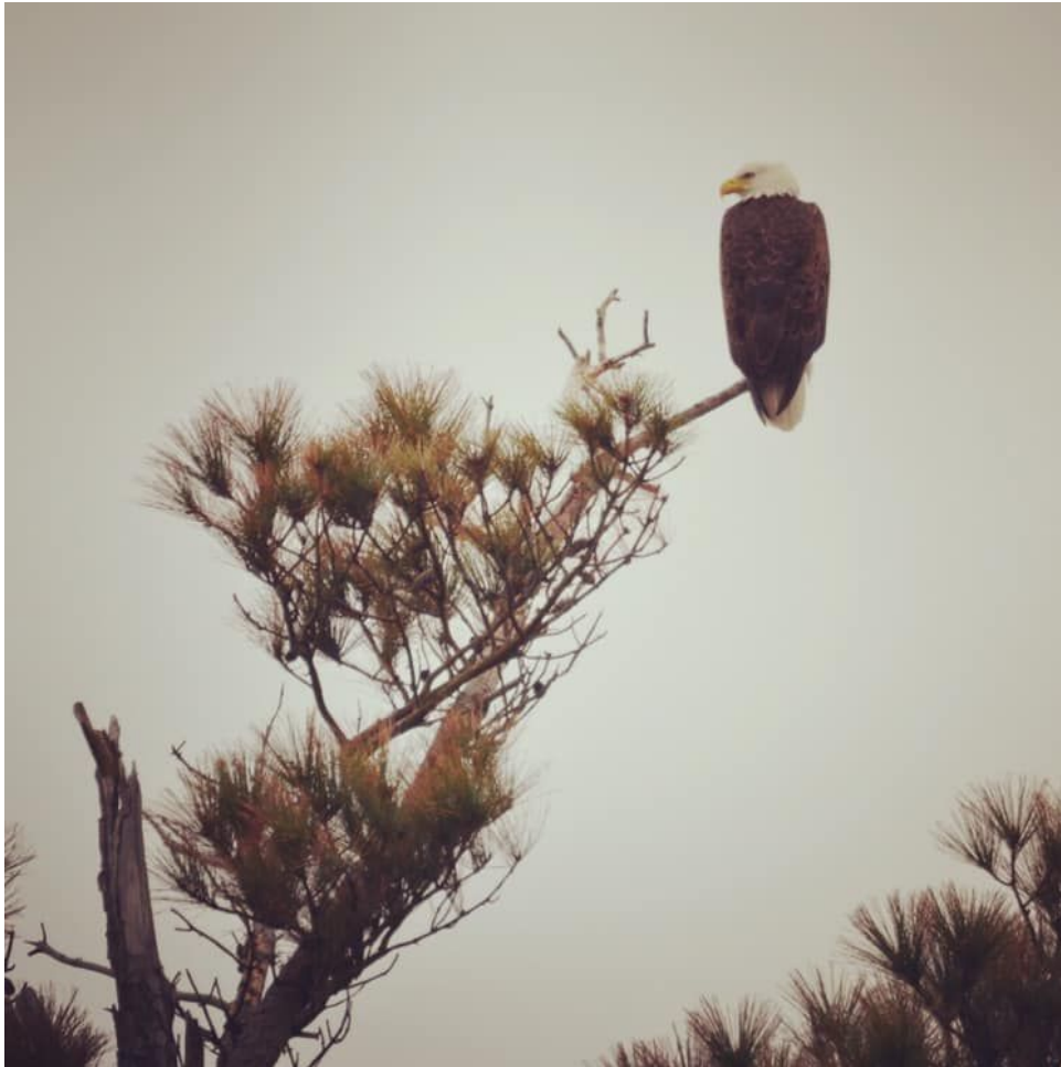
Bald eagle perched near Bodie Island Lighthouse