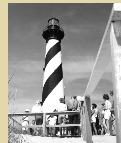
Cape Hatteras Lighthouse history