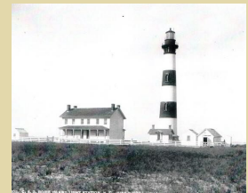
Bodie Island Lighthouse history