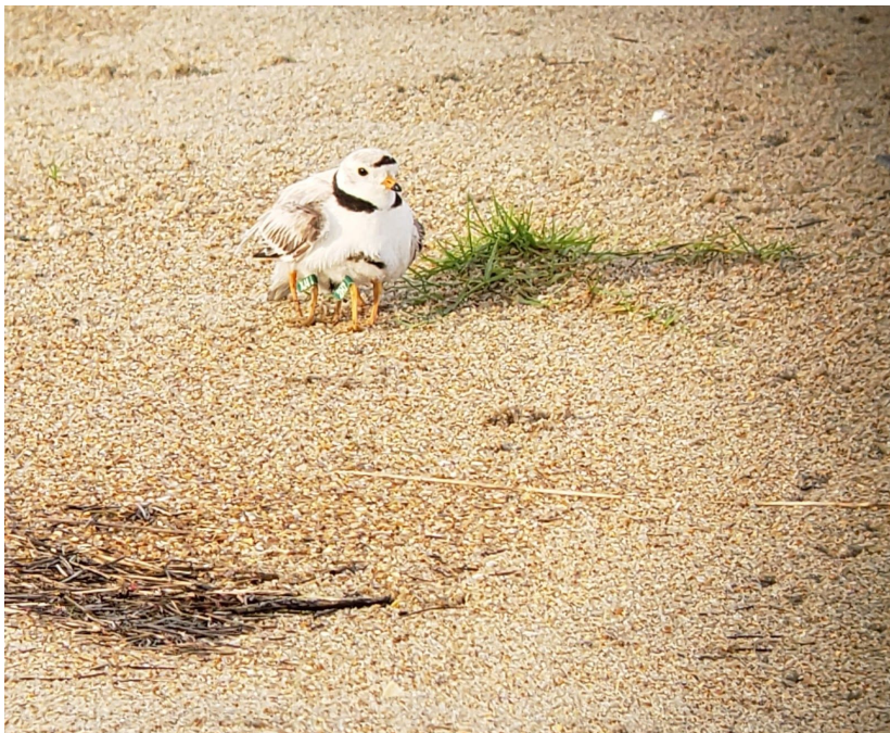
Piping plover adult brooding two chicks at Cape Point earlier this summer. As chicks work their way towards adulthood they are carefully watched and cared for by the adults. Adults periodically brood their chicks in order to regulate their temperature from the harsh elements. As chicks get closer to adulthood they are brooded less.