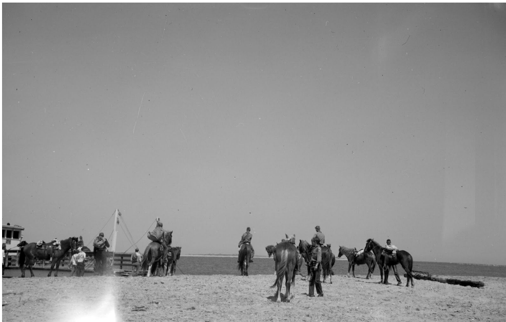
Boy Scouts preparing to travel on the ferry from Ocracoke Island to Hatteras Island. April 24, 1957