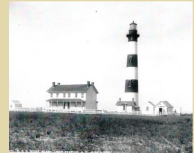
Bodie Island Lighthouse history