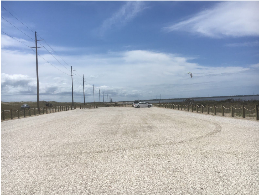
A small ribbon cutting event for the new Kite Point parking area will take place on Wednesday, May 1 at 10:00 am.