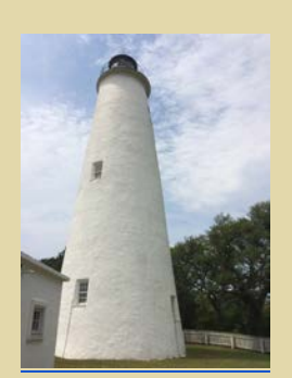
Ocracoke Lighthouse <u>History</u>