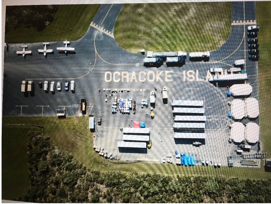
Commodities staging and emergency operations base camp at the Cape Hatteras National Seashore Ocracoke airstrip.