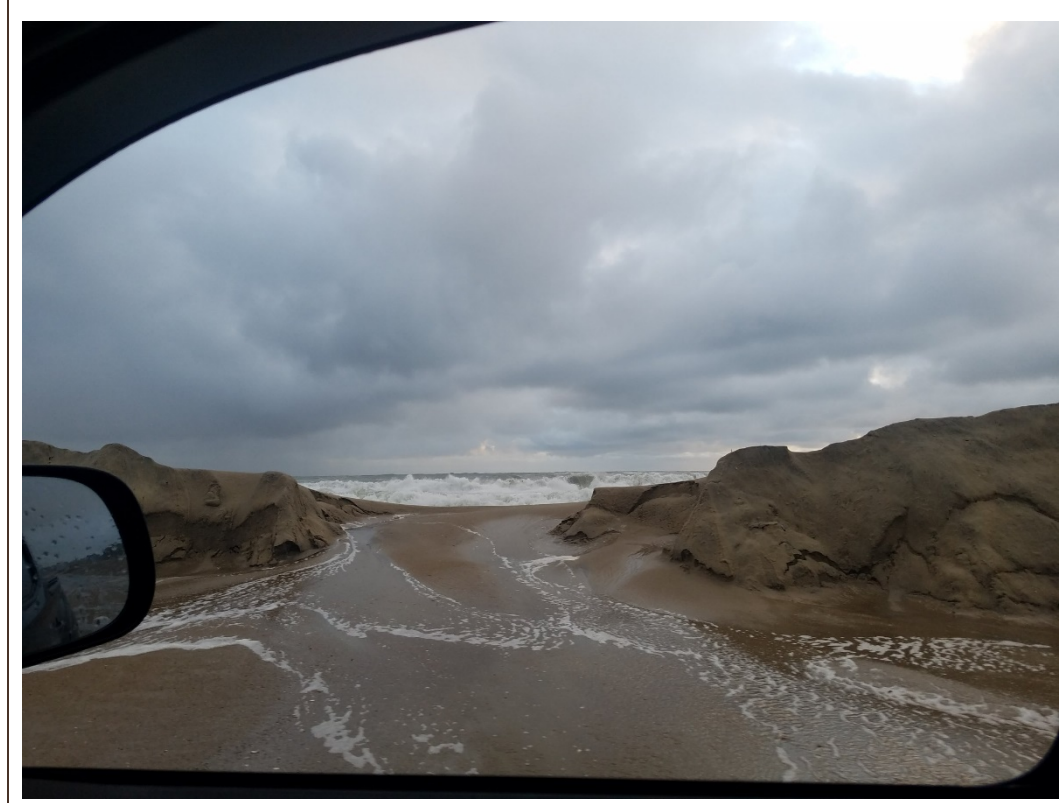
Dune breach north of Rodanthe, NC around high tide this morning.

According to the <u>North Carolina Department of Transportation</u>, motorists should expect mild ocean overwash on NC-12 today, especially during high tide conditions. A few photos from the last couple days are shown below.