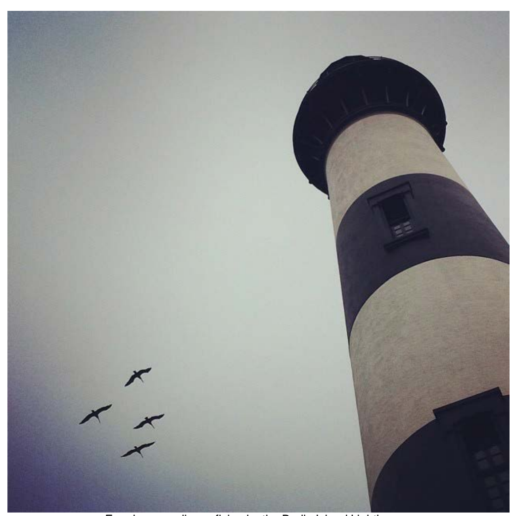
Four brown pelicans flying by the Bodie Island Lighthouse.