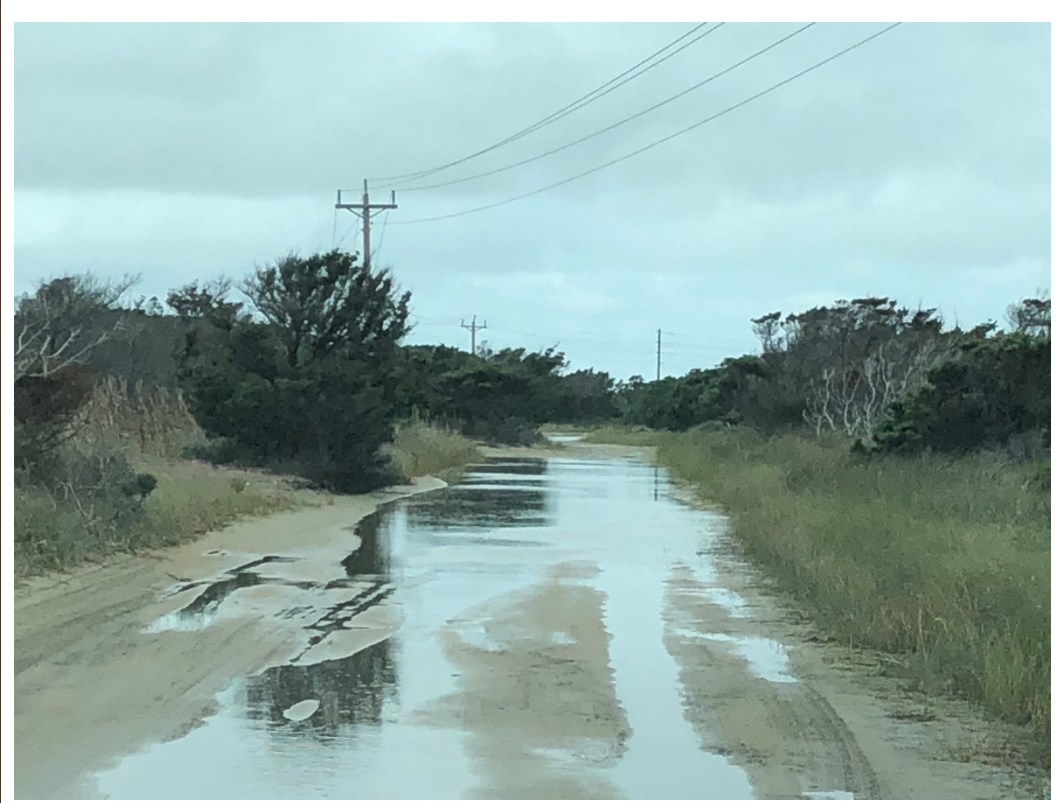
Sections of Pole Road at the south end of Hatteras Island contain up to two feet of standing water.