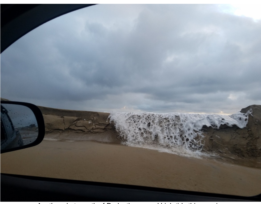
Another photo north of Rodanthe around high tide this morning.