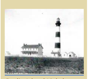
Bodie Island Lighthouse history