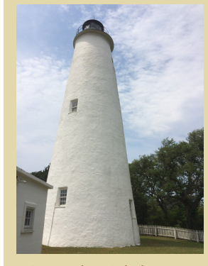
Ocracoke Lighthouse History