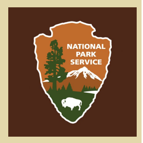
Cape Chronicle August 23, 2018 Volume I, Issue 5