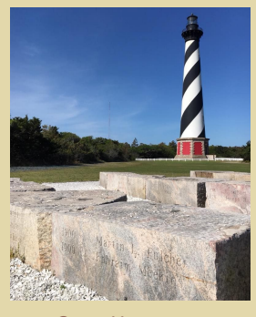
Cape Hatteras Lighthouse history