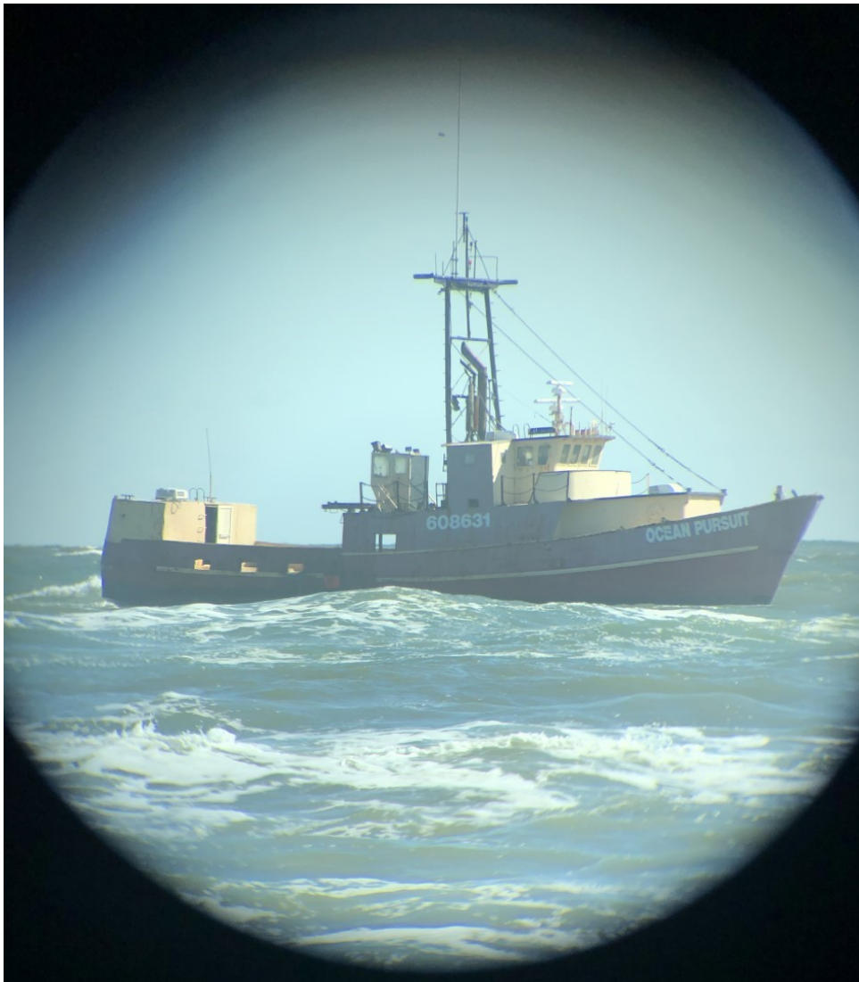
View of the grounded vessel through a spotting scope on March 1.

On the morning of March 1 st , U.S. Coast Guard Station Oregon Inlet responded to a grounded fishing vessel, located between Oregon Inlet and ORV Ramp 4 off Bodie Island. The crew of the 72-foot scallop boat were safely removed by an air crew from U.S. Coast Guard Air Station Elizabeth City. Until the vessel is towed away, it can be easily spotted from the beach, the Basnight Bridge, and NC-12 near the Oregon Inlet Campground and Oregon Inlet Fishing Center.