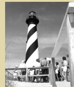
Cape Hatteras Lighthouse history