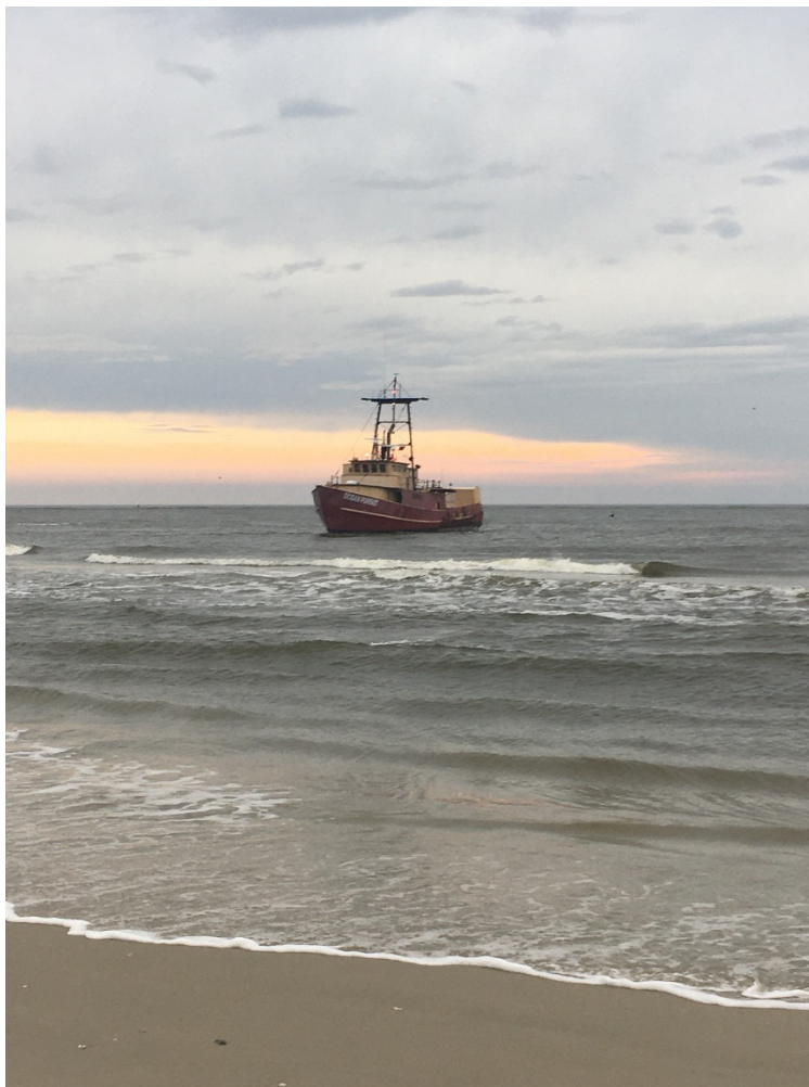
View of the grounded vessel this morning.