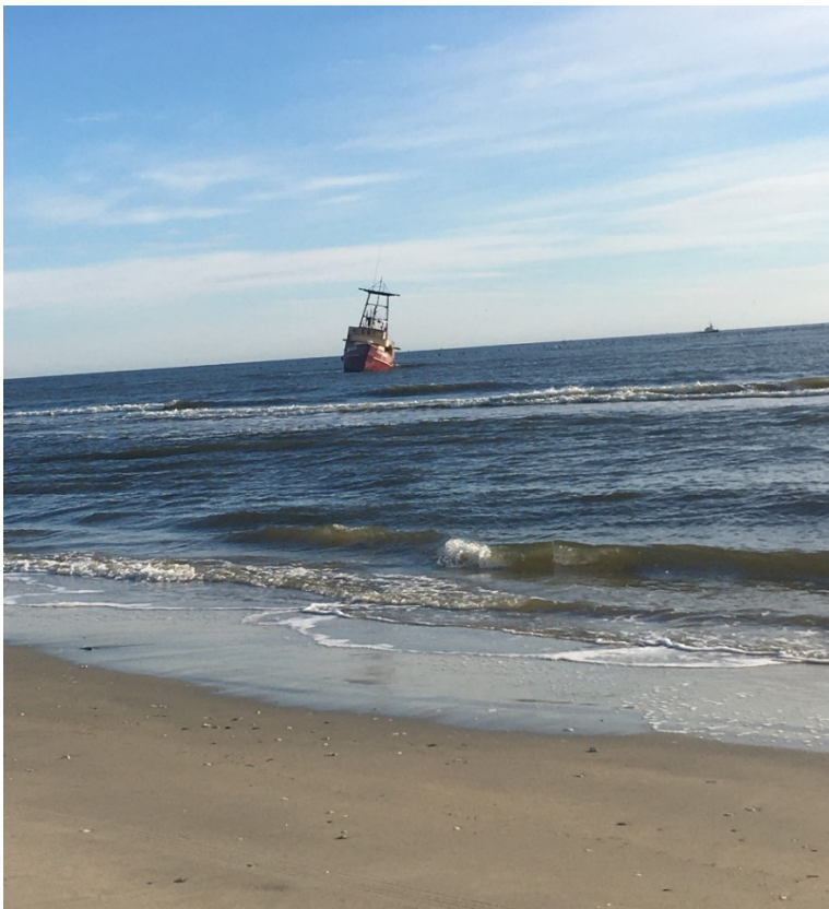
View of the grounded scallop boat the morning of March 2. In this photo the vessel is located approximately a half mile south of ORV Ramp 4.