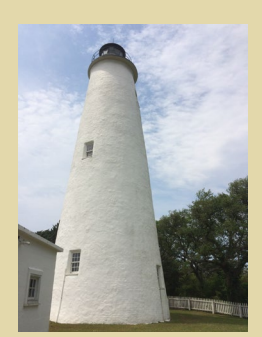
Ocracoke Lighthouse <u>History</u>