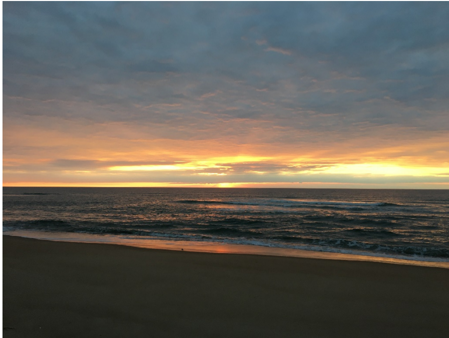
Sunrise view from north of Ramp 43 in Buxton.