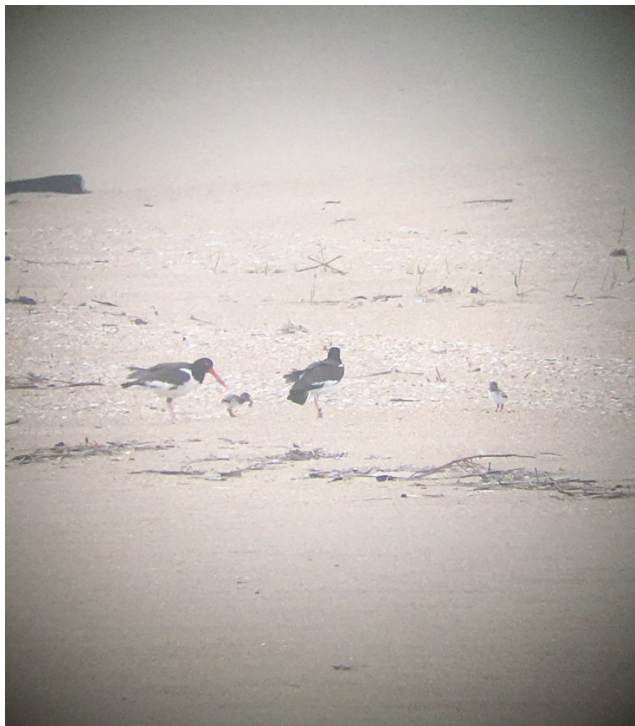
Two adult American oystercatchers with two chicks between Ramp 44 and Cape Point. The two chicks hatched the morning of Saturday, May 23 rd .