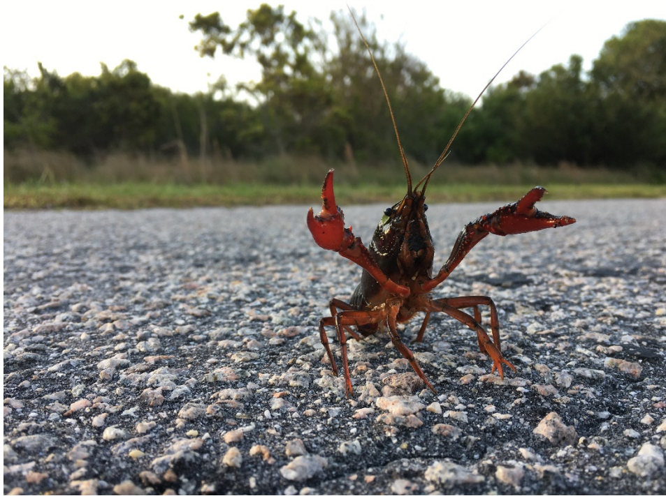
Burrowing crayfish found on Hatteras Island after a large rainstorm.