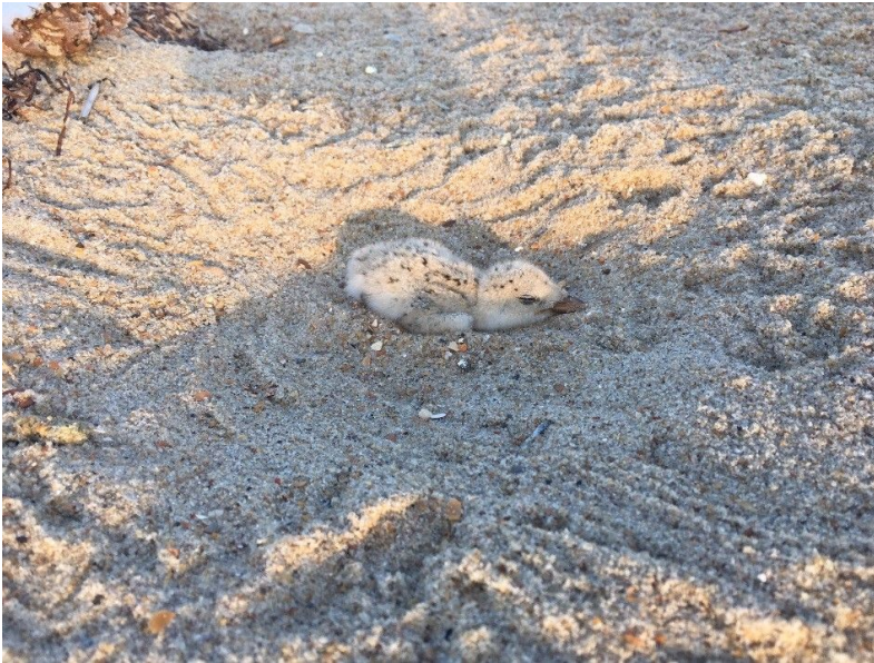
Recent photo of a Black skimmer chick located south of Ramp 44.