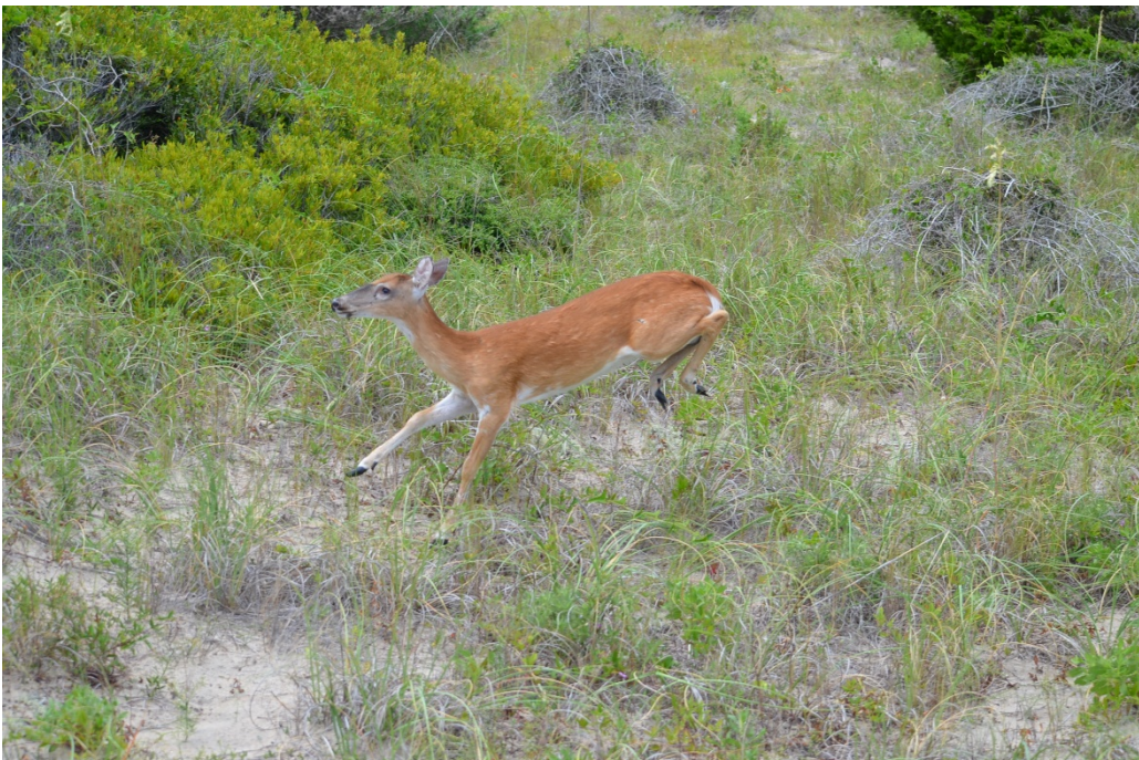
White-tailed deer frolics behind primary dune north of Ramp 30 on Hatteras Island.