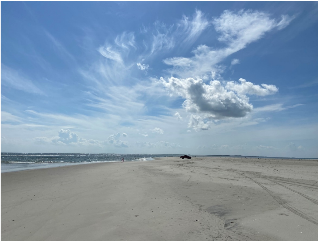
Access to South Point on Ocracoke Island was fully restored on Tuesday afternoon.