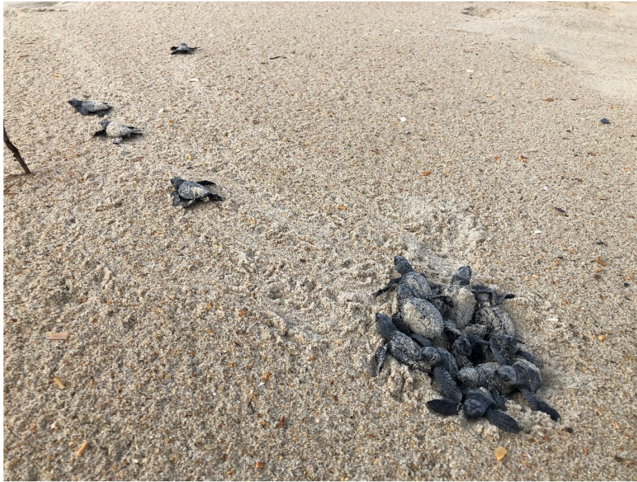
On August 25, Kemp's Ridley sea turtle hatchlings emerged from a nest south of Ramp 55 on Hatteras Island. When many hatchlings emerge at once from a nest, it is called a "boil."