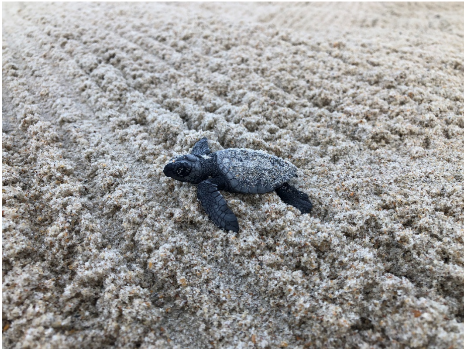
Kemp's Ridley sea turtle on its way to the Gulf Stream where it will drift and float for about two years before returning to the shallower waters above the continental shelf to live out the rest of its life.