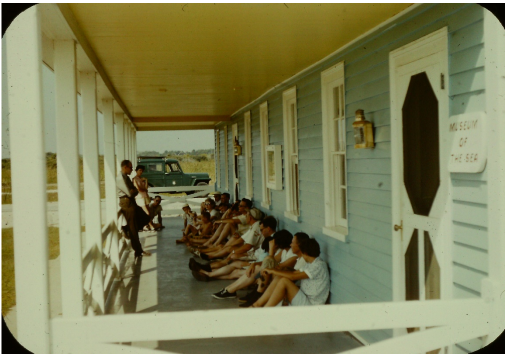
Visitors enjoy an interpretive program on the porch of the Museum of the Sea.