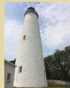
Ocracoke Lighthouse History