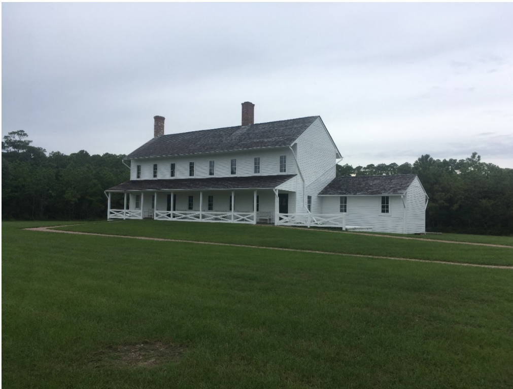
Former Double Keepers' Quarters at Cape Hatteras Lighthouse, site of the Museum of the Sea.