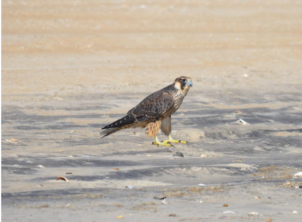
Peregrine falcon enjoying the sun and the beach on Bodie Island.