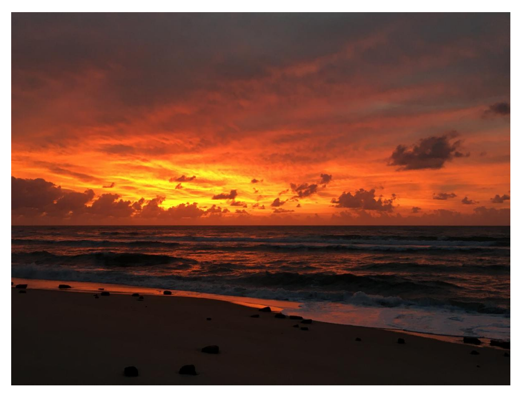
Incredible sunrise at Cape Point on October 21st.