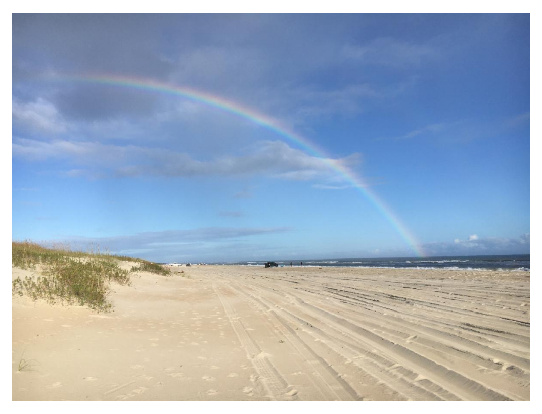
View of a rainbow over Ocracoke Island.