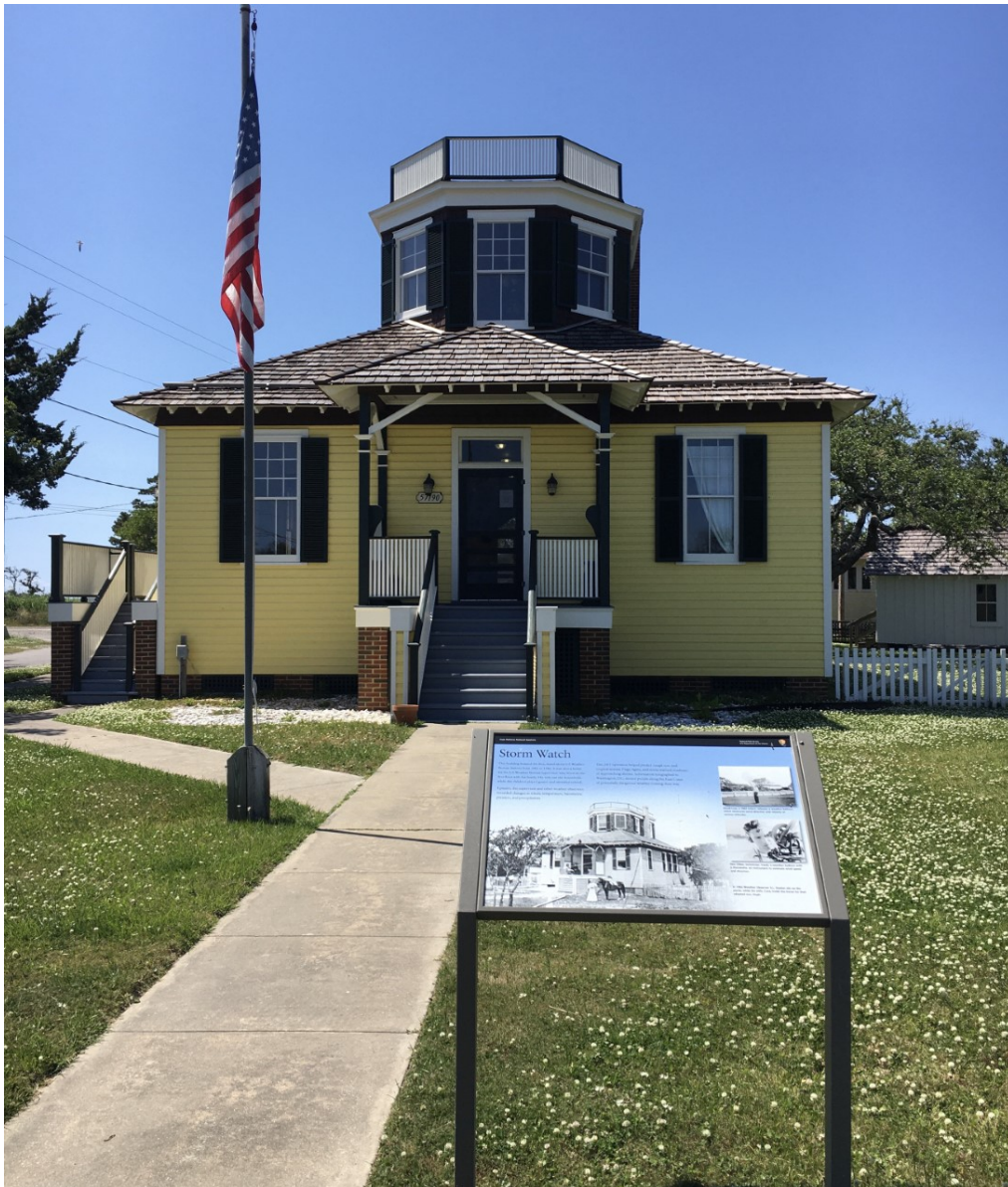
New educational display in front of the U.S. Weather Bureau Station in Hatteras, N.C.