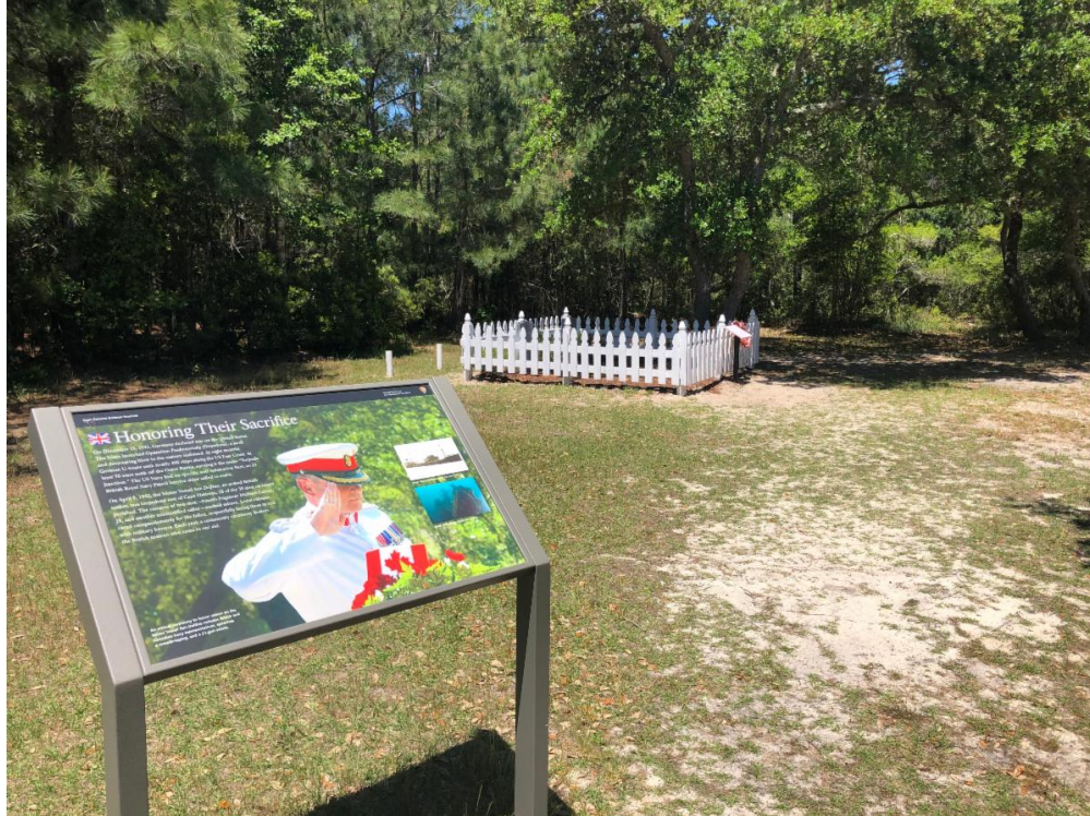
New educational display at the Buxton British Cemetery.