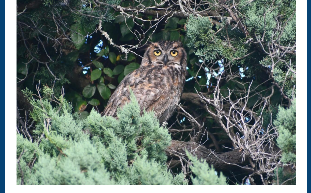
A great horned owl hunts on Ocracoke Island.