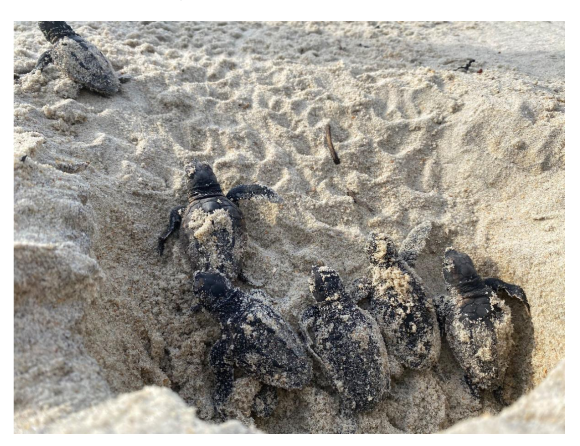
Loggerhead sea turtle hatchlings make their way to the ocean.