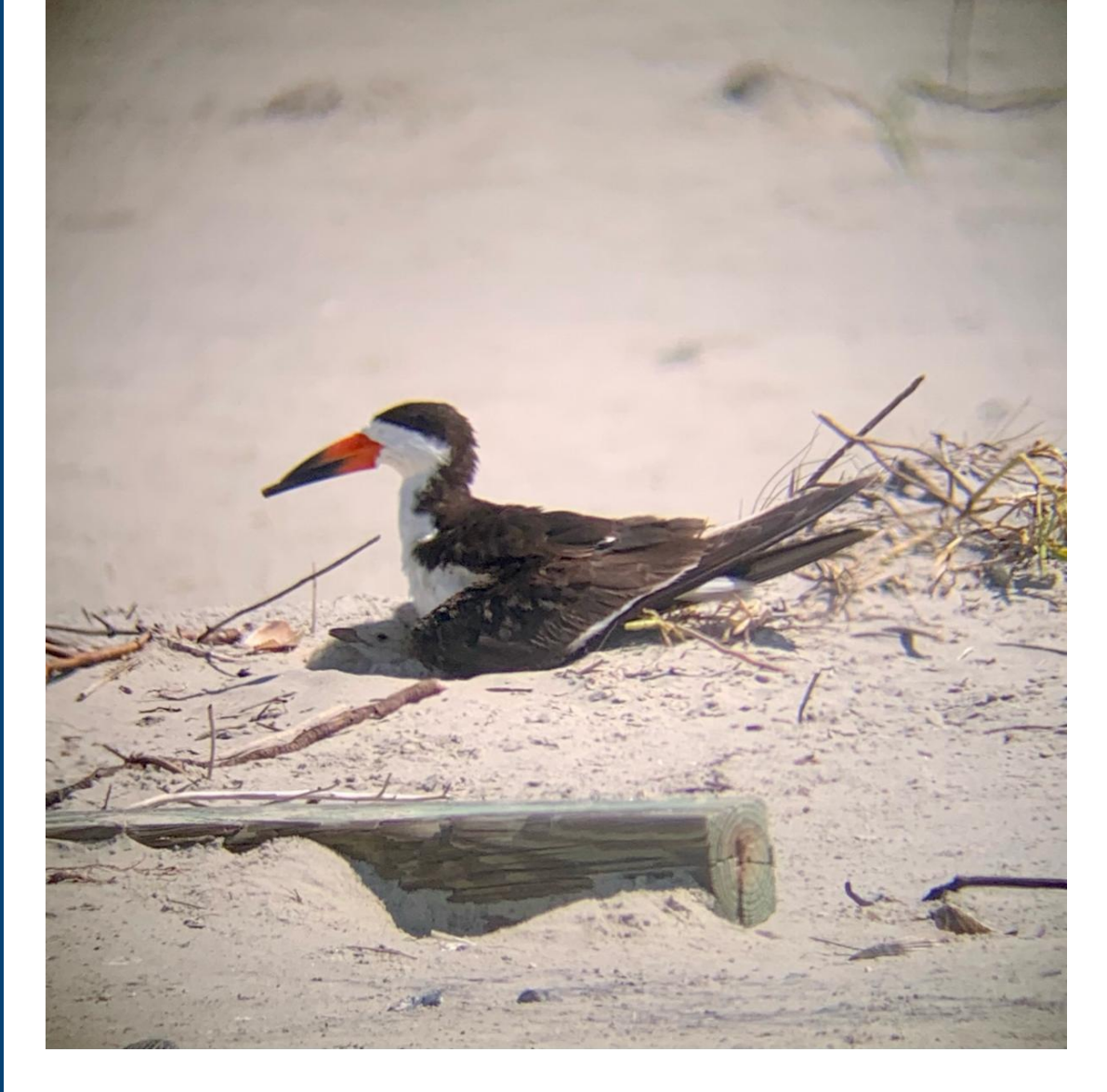
The shorebird nesting season is winding down, but there are still a few more unfledged black skimmer chicks at the tip of South Point on Ocracoke Island. In this photo, a black skimmer chick takes refuge under its parent's wing.