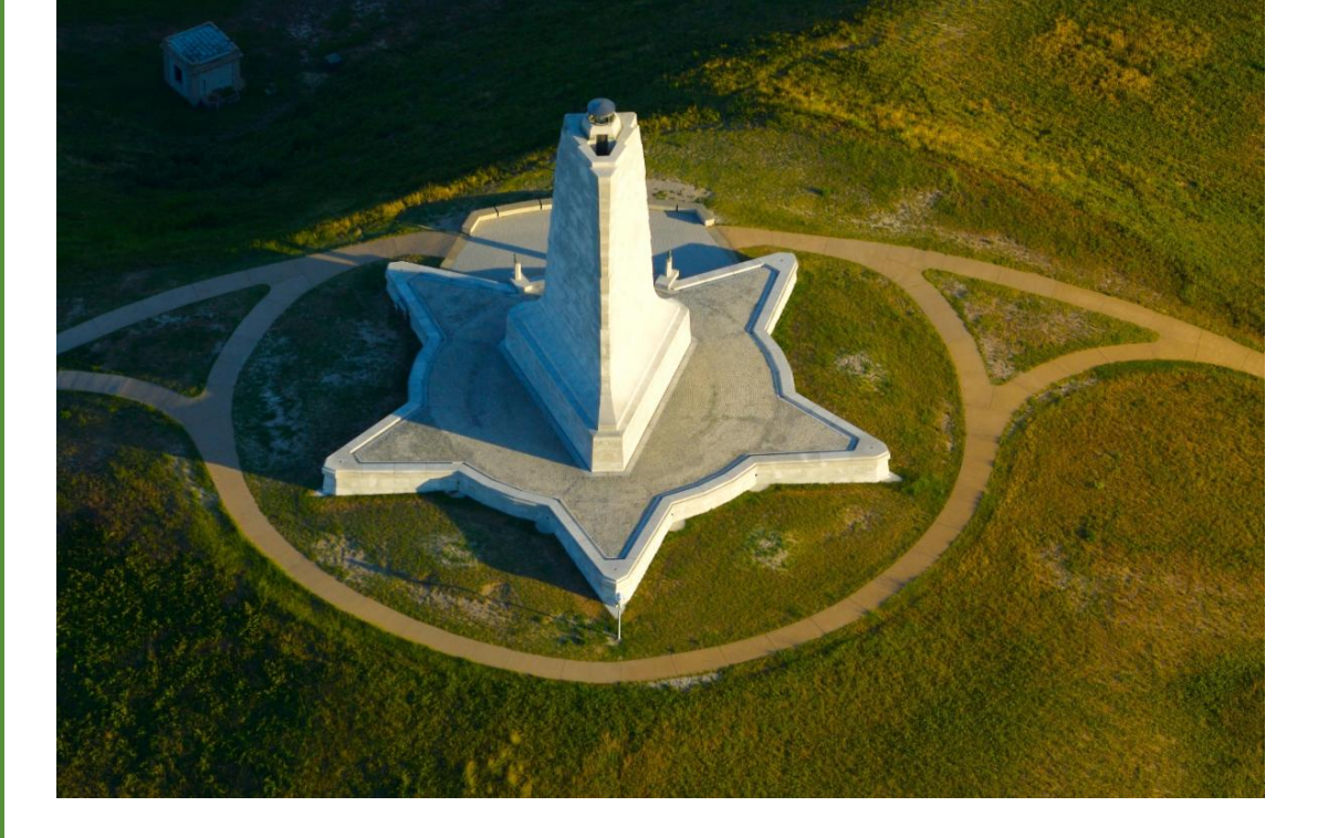
Aerial photo taken in 2011 of the Wright Brothers Monument at Wright Brothers National Memorial.