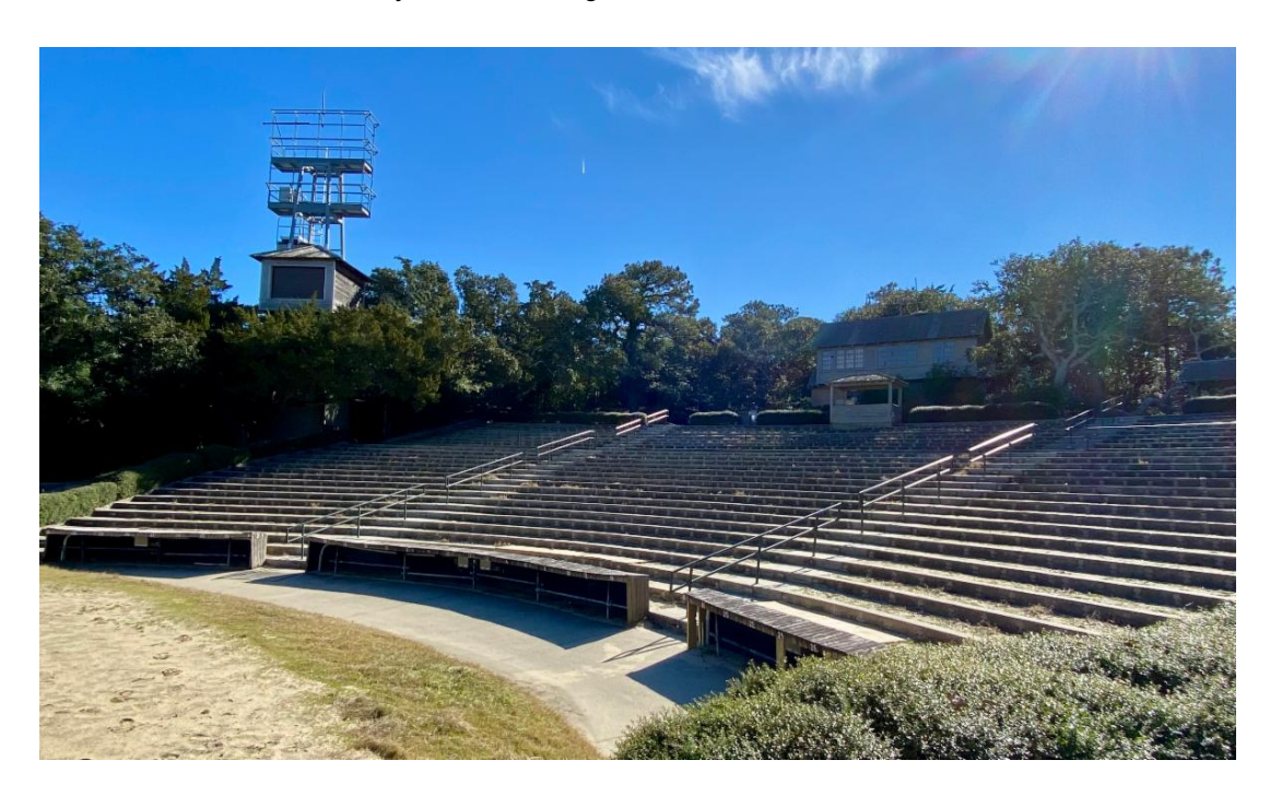
Fort Raleigh National Historic Site's Waterside Theatre will receive all new seating before the 2022 performance season of "The Lost Colony." Read more in a recent <u>news release</u>.