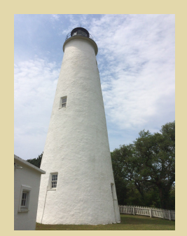
<u>Ocracoke Lighthouse</u> <u>History</u>