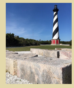
Cape Hatteras Lighthouse history