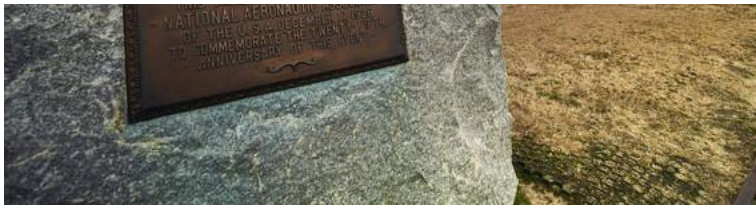
Close up view of the First Flight Boulder at Wright Brothers National Memorial.