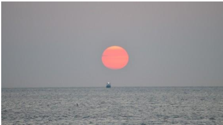
Sunrise view from near Oregon Inlet.