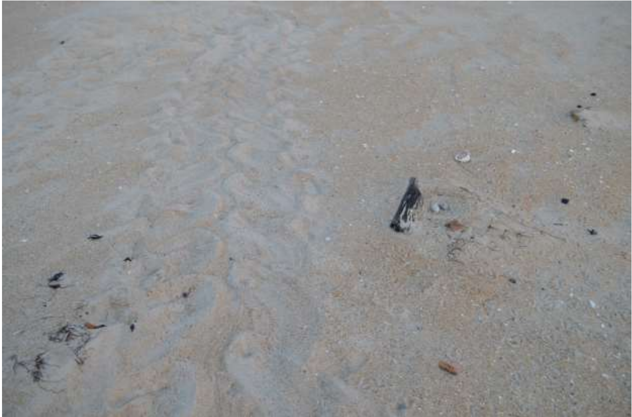
Sea turtle crawl beside an American oystercatcher nest on Bodie Island.

National Park Service 1401 National Park Drive Manteo, NC 27954