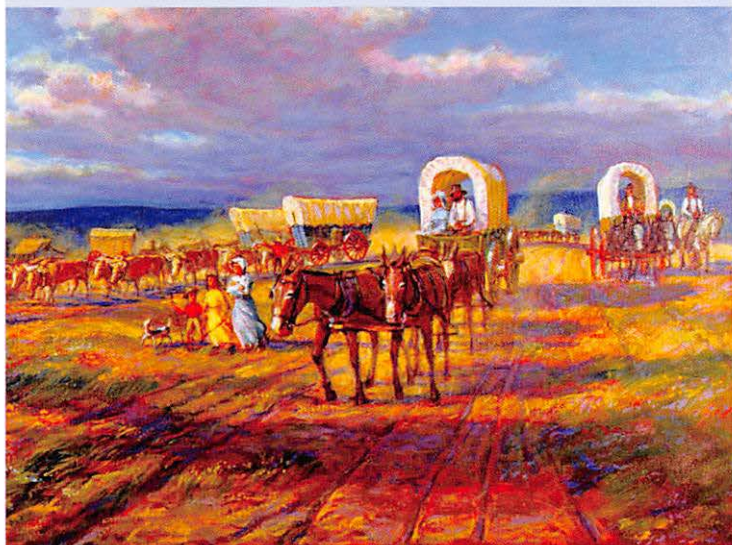
Illustration by Charles Goslin

We are now camped on Bull creek a short distance from the forks of the road one to Santa Fe and one other to Salt Lake via Forts to California and Oregon.