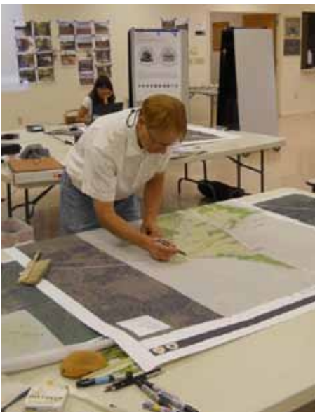
During the Alcove Spring charette two site plan alternatives were presented in a public meeting.