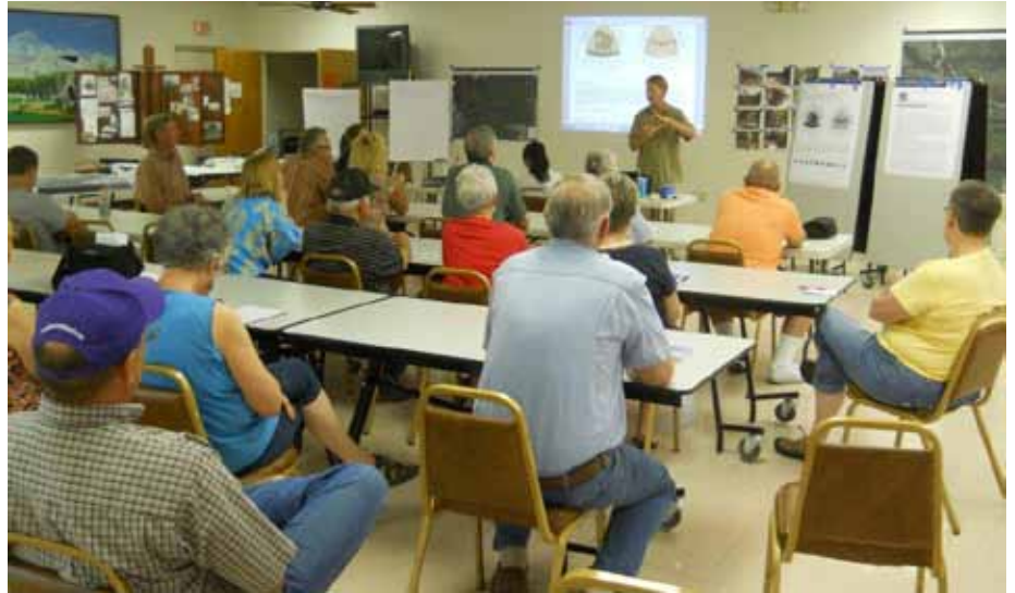
Two public meetings were held in Blue Rapids, Kansas to discuss and present recommendations for site planning at Alcove Spring Park June 2013.