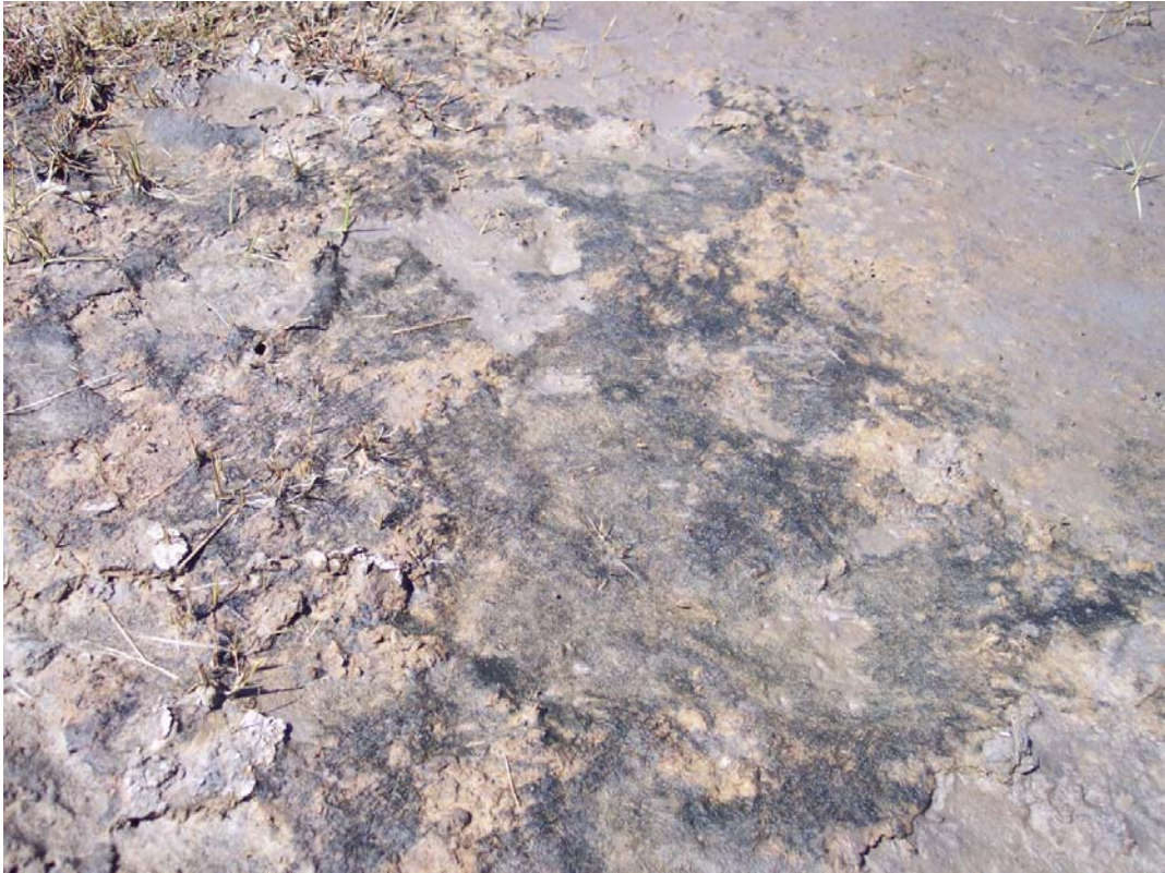
Plate 1. Benthic microalgal mat on edge of tidal marsh on Shackleford Banks, NC.