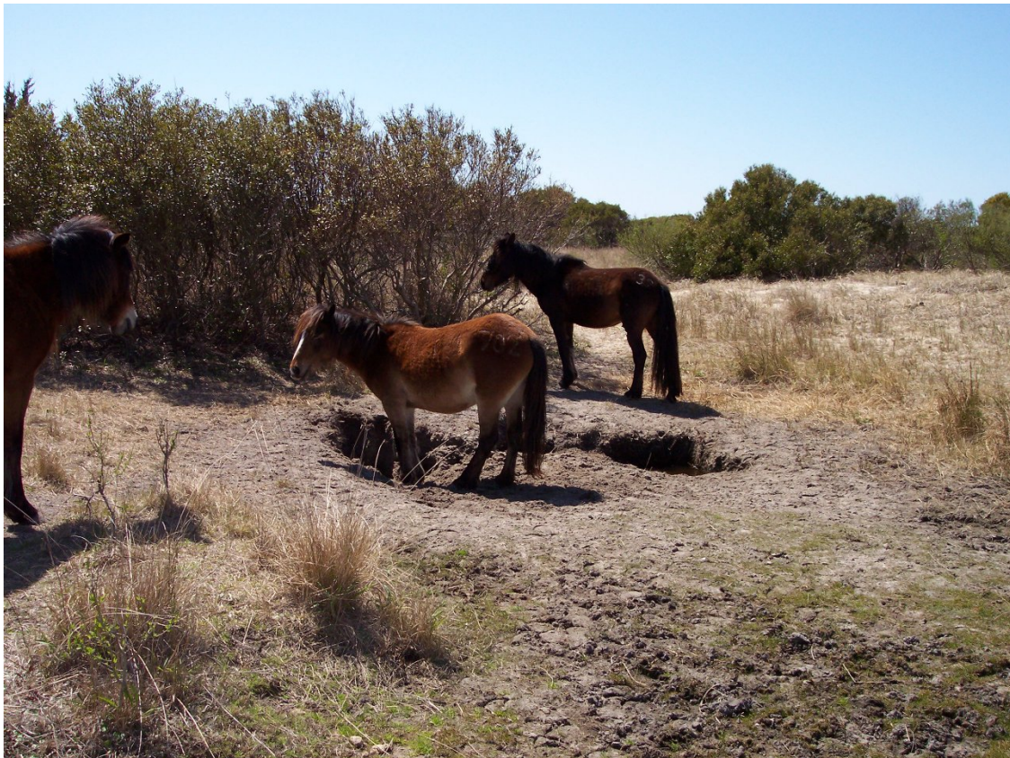
Plate 2. Horses digging freshwater drinking hole near salt marsh, Shackleford Banks, N.C.

The most obvious component of Shackleford Bank's large fauna is the herd of approximately 125 wild horses. Horses have been living on the Outer Banks for centuries, and roam the entire length of Shackleford Banks. The herd is under some management to maintain a genetically diverse population at a healthy level through immunocontraception and periodic adoption of excess individuals (NPS 2002). Fresh drinking water sources for the horses are abundant on the western end of the island. On the eastern end the water resources are primarily salt marsh. However, two of this report's authors observed a small group of horses dig a well on the east end and drink from it while keeping the two researchers away from it (Plate 2). The researchers returned two hours later when the dig was deserted and measured the salinity of the well, which was only 0.5 ppt in an area dominated by salt marshes. Potentially relevant to the quality of the water resources on Shackleford Banks are the very abundant horse manure piles especially concentrated in the maritime forest. These manure piles are sources of concentrated nutrients and fecal bacteria.