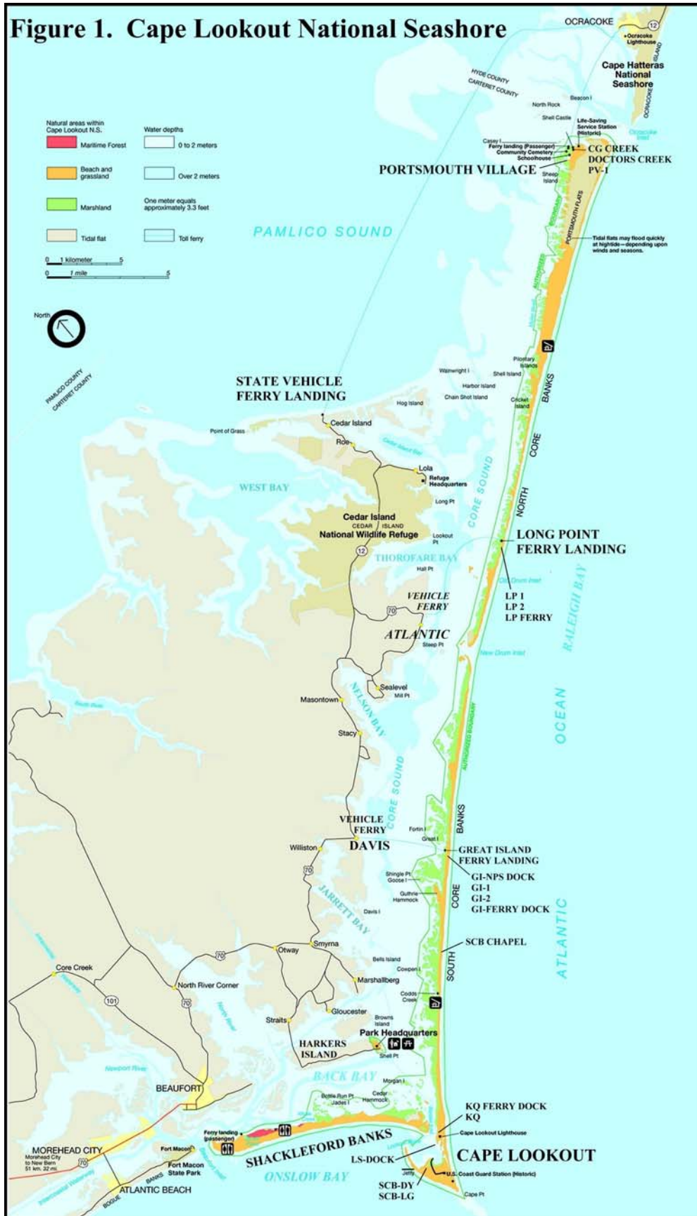
Figure 1. Cape Lookout National Seashore