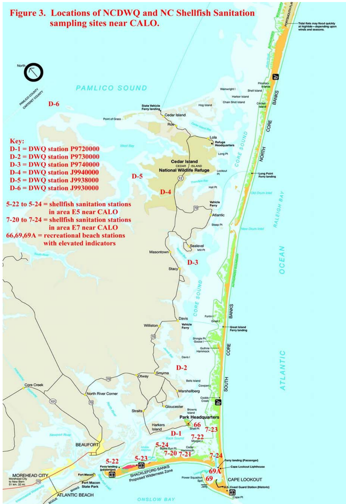
Figure 3. Locations of NCDWQ and NC Shellfish Sanitation sampling sites near CALO.