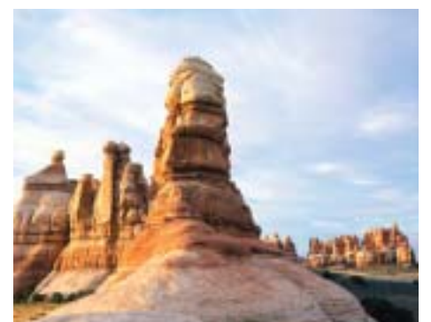
Rock spires in Chesler Park