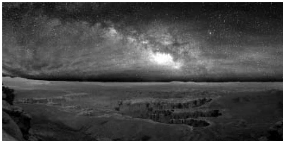
The night sky view from Grand View Point at the Island in the Sky. The bright cluster of stars near the middle of the photograph is part of the Milky Way.

IT IS 11 P.M. ON A WARM SUMMER NIGHT AND I'm sprawled like a cat across the sandstone near Grand View Point at the Island in the Sky. This place always gives me the sensation of being on top of the world. The only sounds I hear are the occasional buzzing of insects and the soft hum of my telescope and camera. An endless sky filled with stars washes over me. I believe this moonless night is one of the darkest I have ever seen. Surely I am not the first human to observe the cosmos from here, yet tonight I am alone.