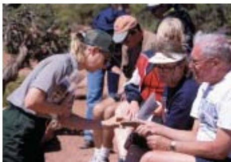
Interpretive program at Grand View Point