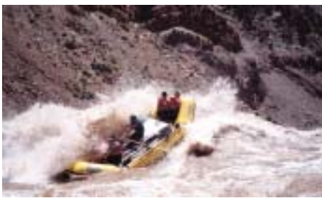
A raft plunges through a rapid on its way through Cataract Canyon.