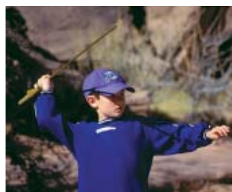
A third grader tries his hand at the atlatl, a precursor to the bow and arrow.