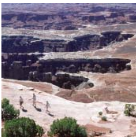
Hiking the Grand View Point Trail