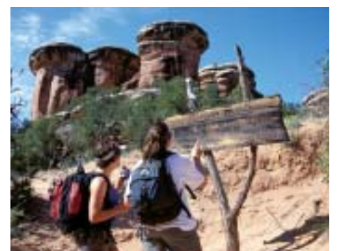
On the trail to Chesler Park