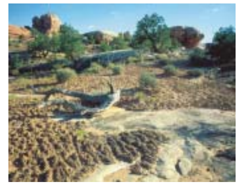
WATCH YOUR STEP! Cryptobiotic soil crust is a living groundcover that forms the foundation of high desert plant life in Canyonlands and the surrounding area. This knobby, black crust is dominated by cyanobacteria, but also includes lichens, mosses, green algae, microfungi and bacteria.