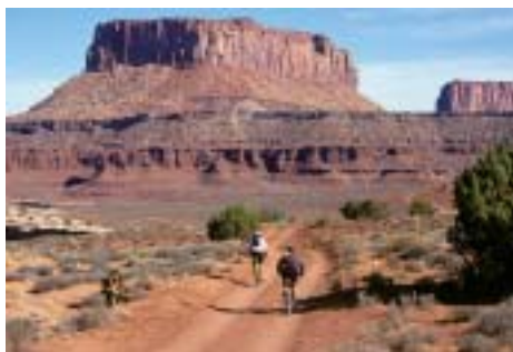
Mountain biking on the White Rim Road