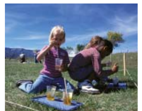
First graders acting out the roles of various plant parts.