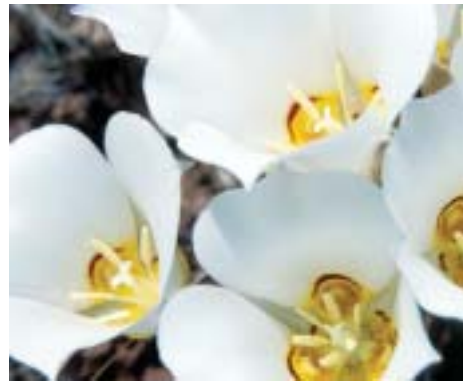
April and May are the best months to view wildflowers in Canyonlands. Shown above left: dwarf lupine ( Lupinus pusillus ) and common globemallow ( Sphaeralcea coccinea ). Above right: sego lily ( Calochortus nuttallii ).