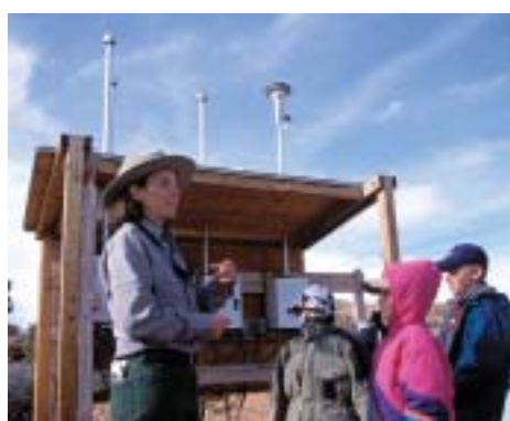
Fifth graders learning about the Island in the Sky air quality monitoring station.

For more information on Canyon Country Outdoor Education, including program internships and to download the curriculum, visit the outdoor education website at www.nps.gov/cany/education , or contact the park (see page two).