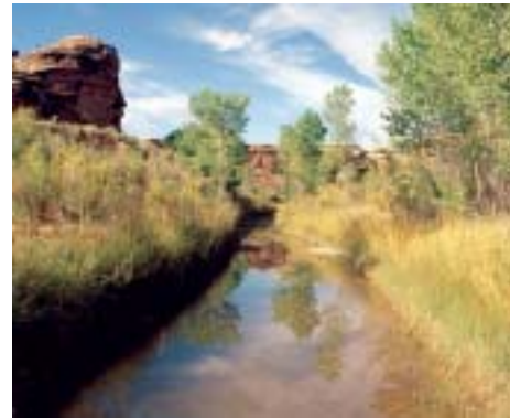
Salt Creek Canyon with (left) and without (right) tamarisk. Tamarisk often forms dense groves that block out other species. Notice the greater abundance of surface water and variety of plants in the right hand photo.